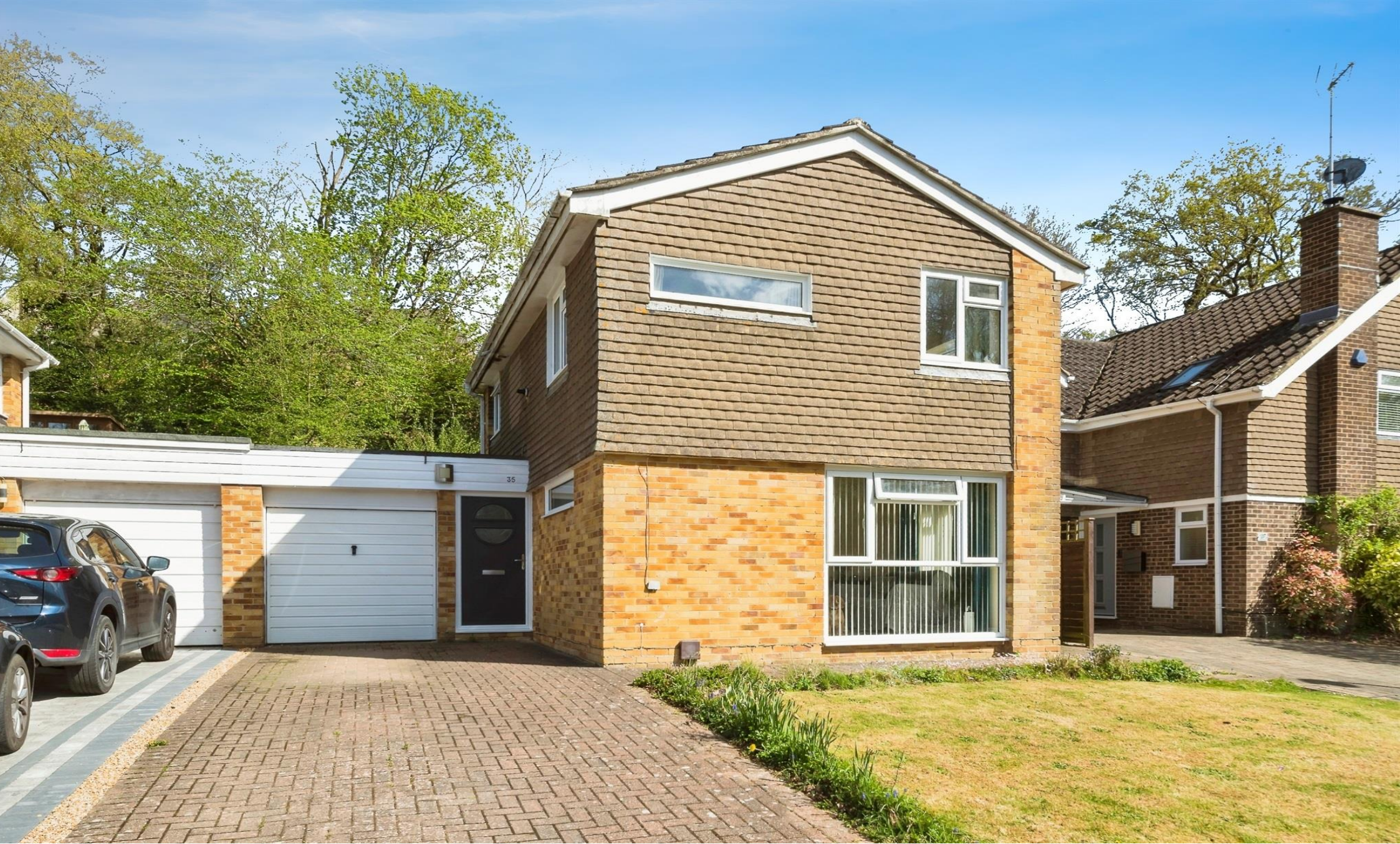
Oak Hall Park, Burgess Hill RH15 0DH