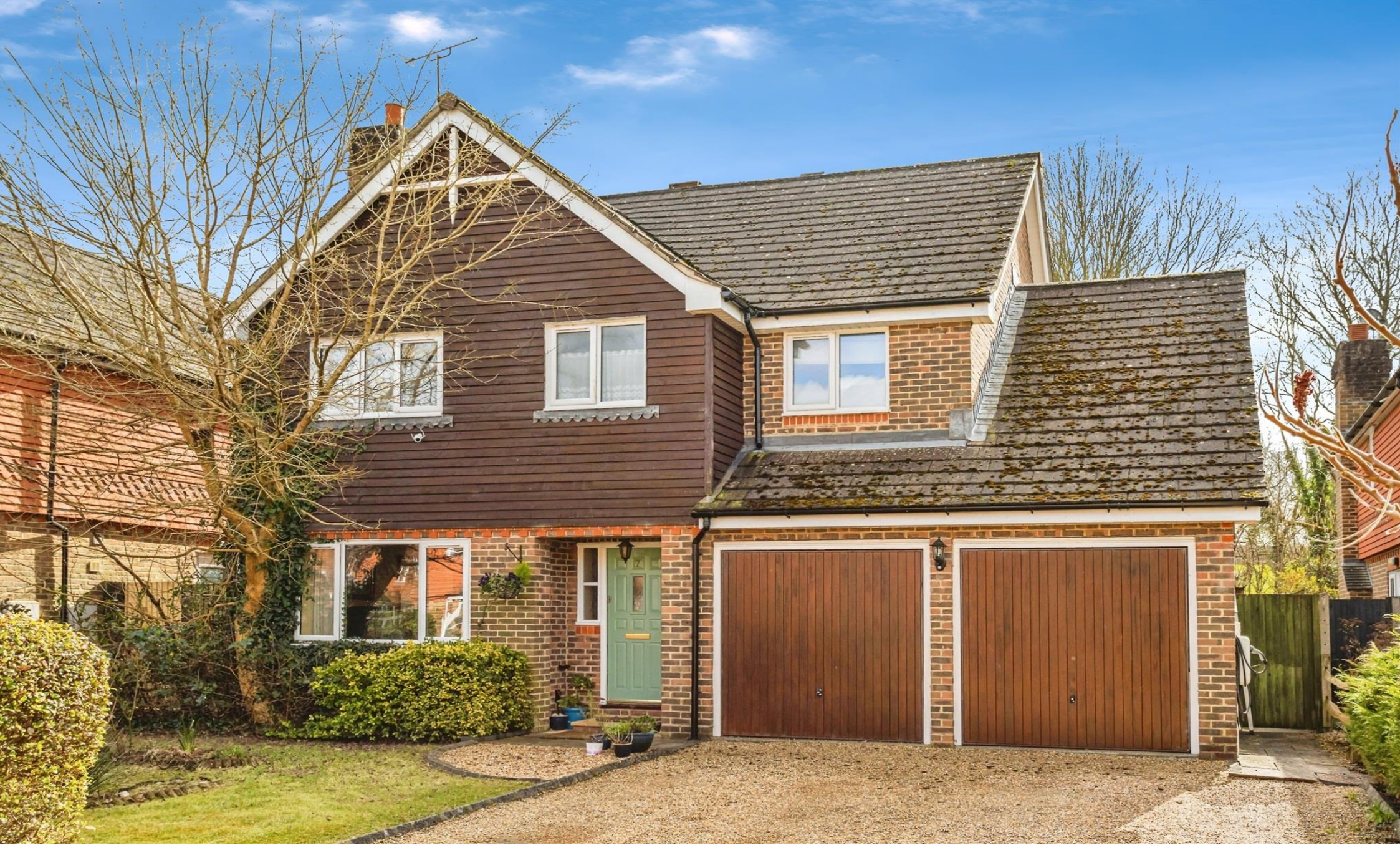
Harvey Close, Sayers Common, HASSOCKS BN6 9XN