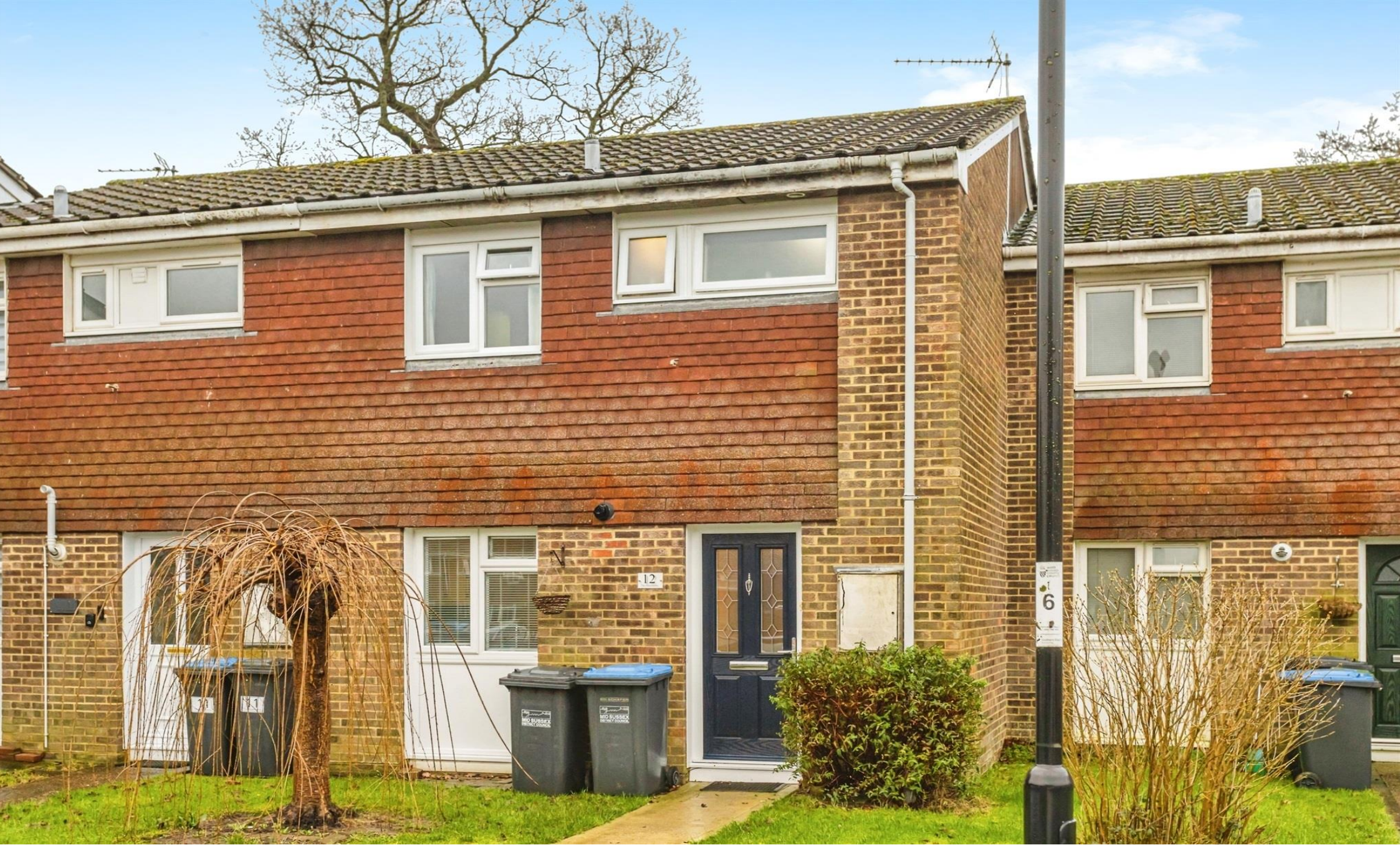
The Hawthorns, Burgess Hill RH15 8RL