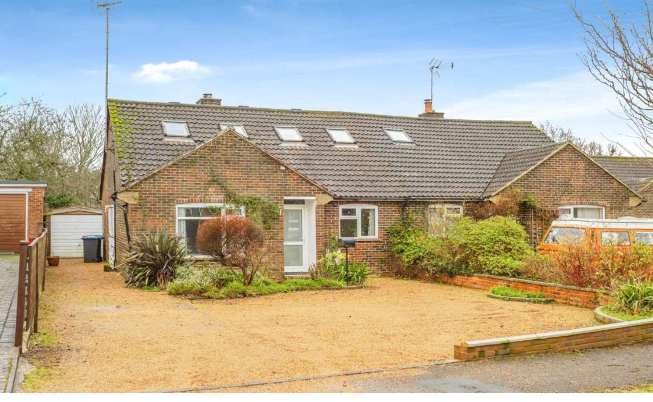
Orchard Way, Hurstpierpoint Hassocks BN6 9UB