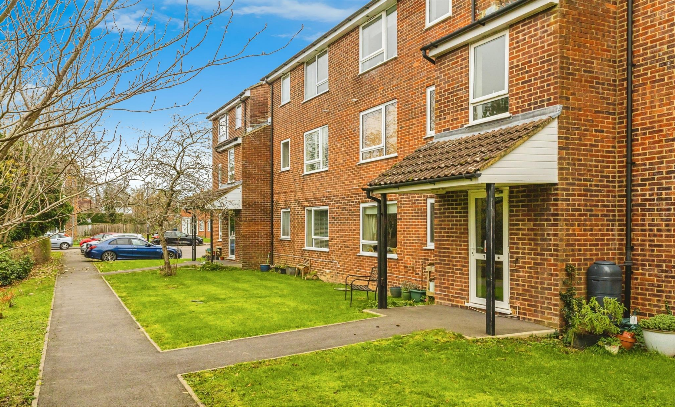
Warner Court Church Close, BURGESS HILL RH15 8TA