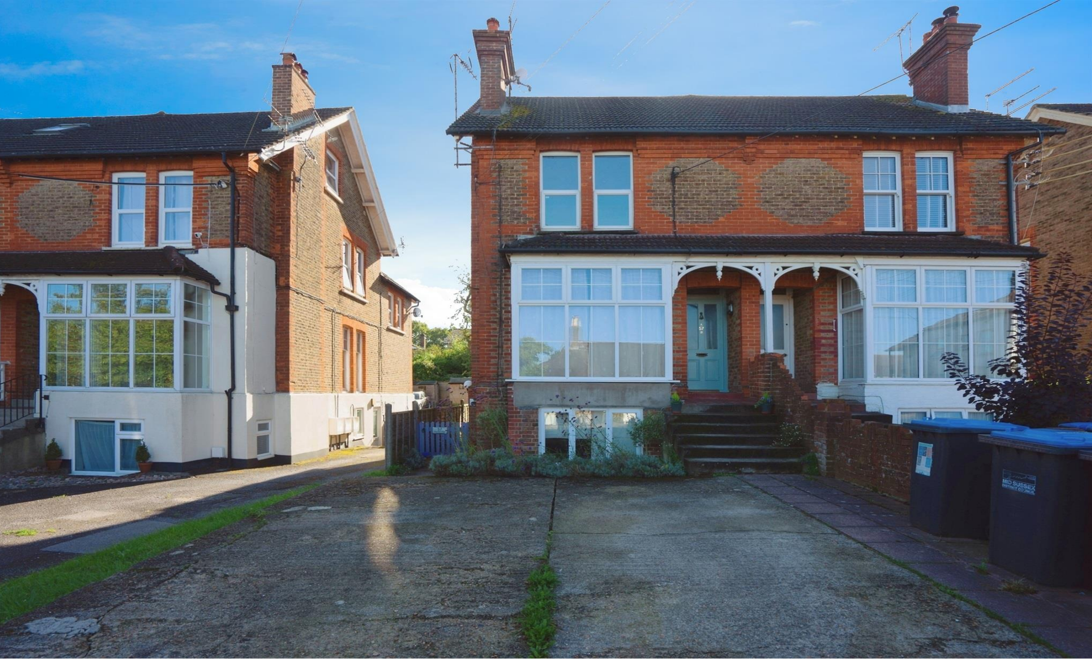
Upper Maisonette Mill Road, Burgess Hill RH15 8DY