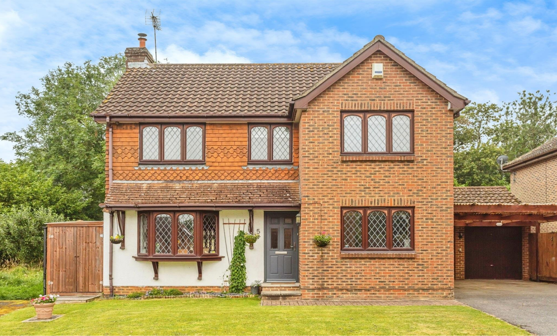
Hawthorn Close, Burgess Hill, RH15 0UH