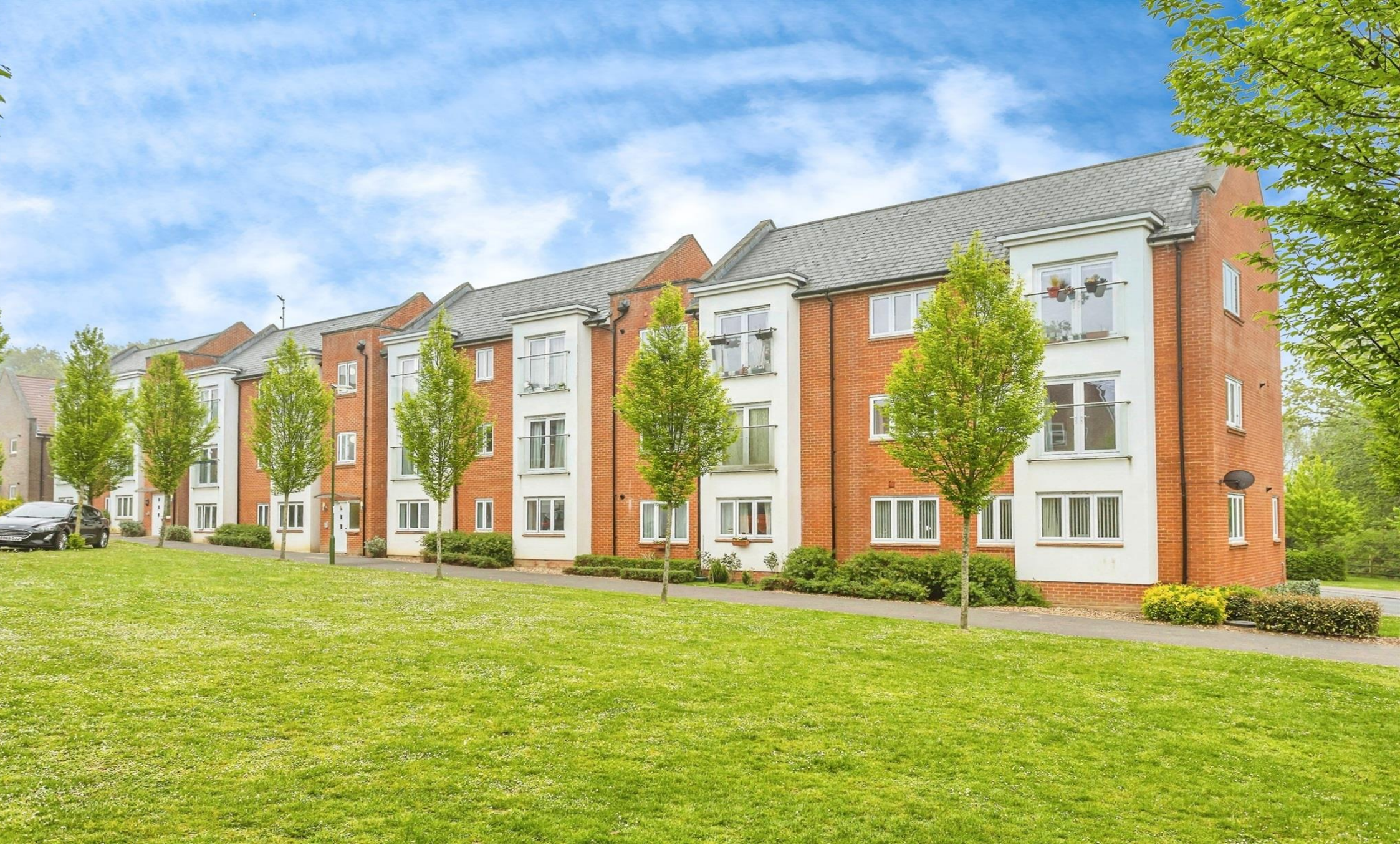
Skylark Way, Burgess Hill, RH15 9DL