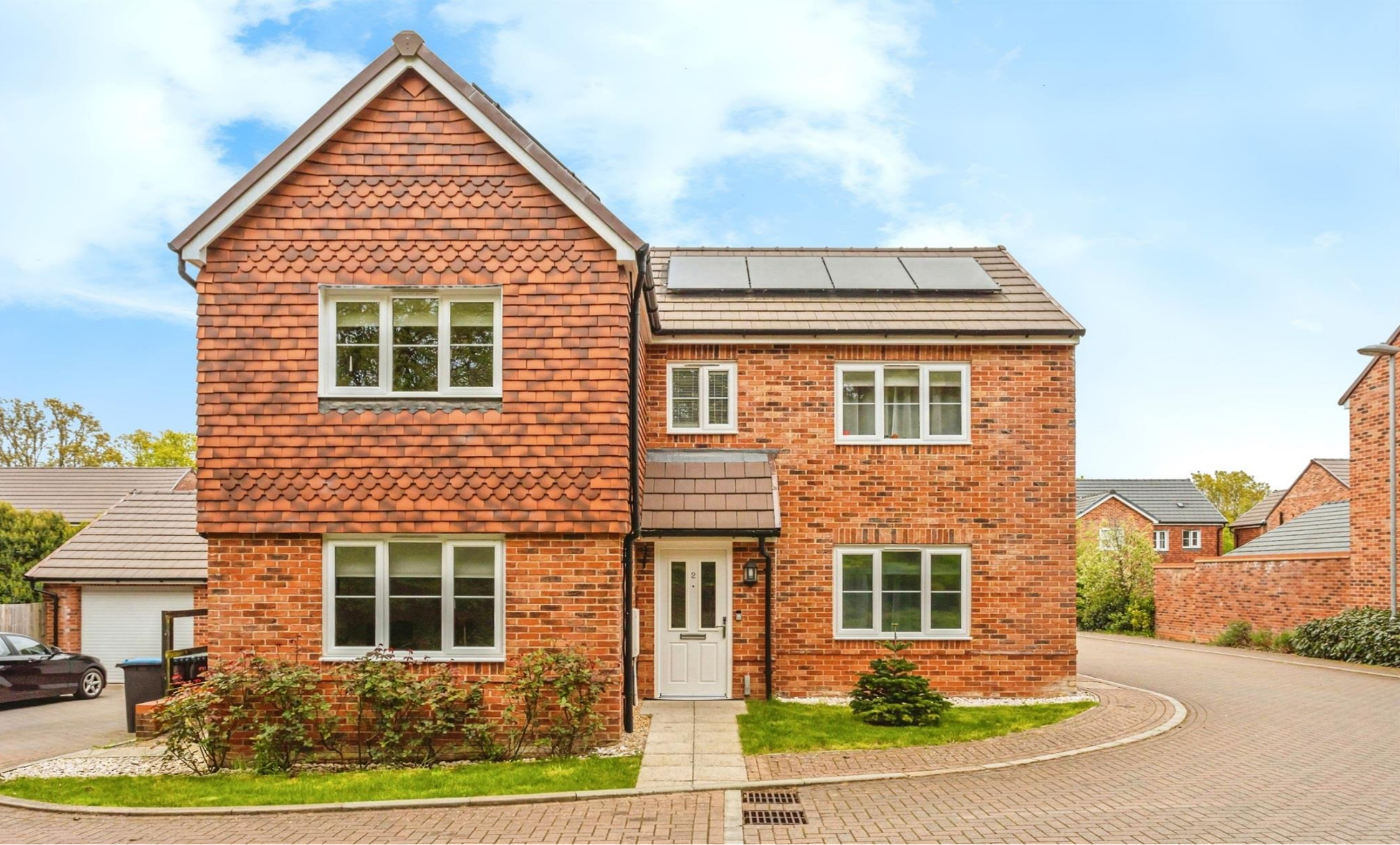
Hestia Place, Burgess Hill RH15 0XP