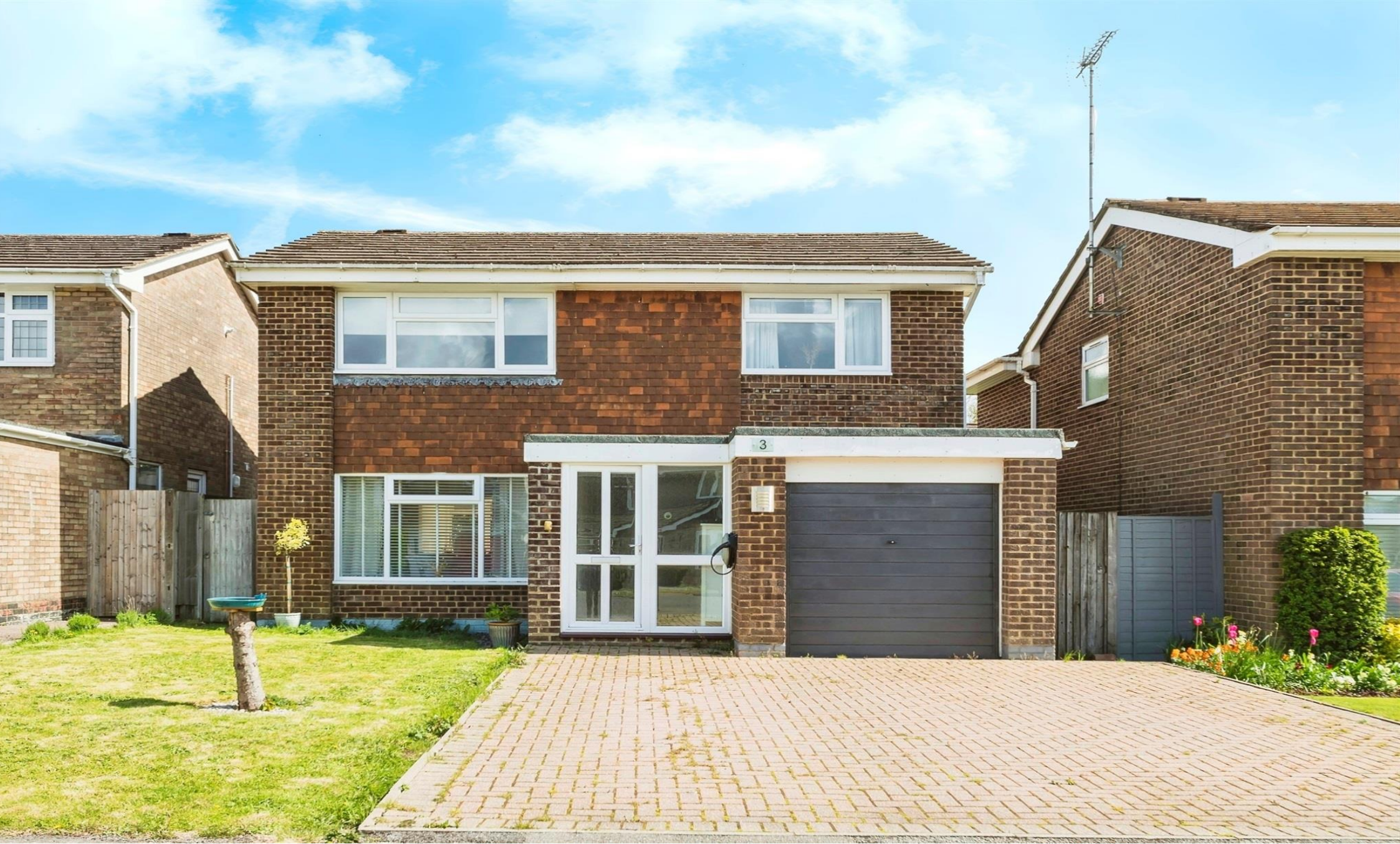
Bankside, Hassocks, BN6 8EL