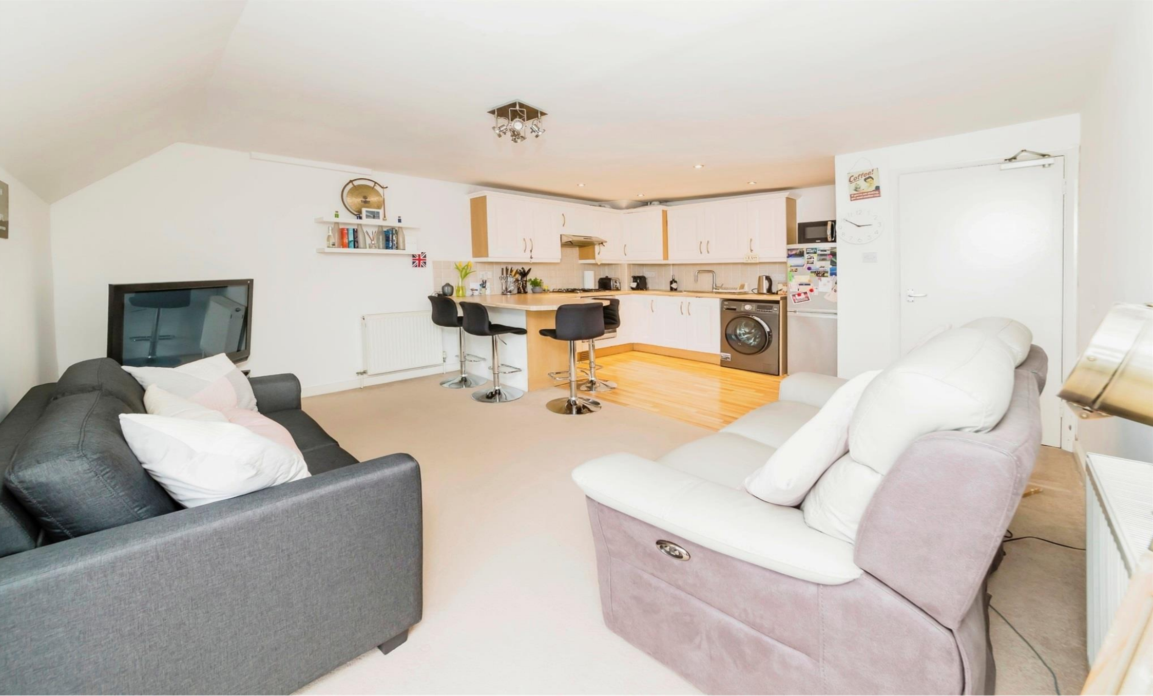
Station Road, Burgess Hill, RH15 9DE