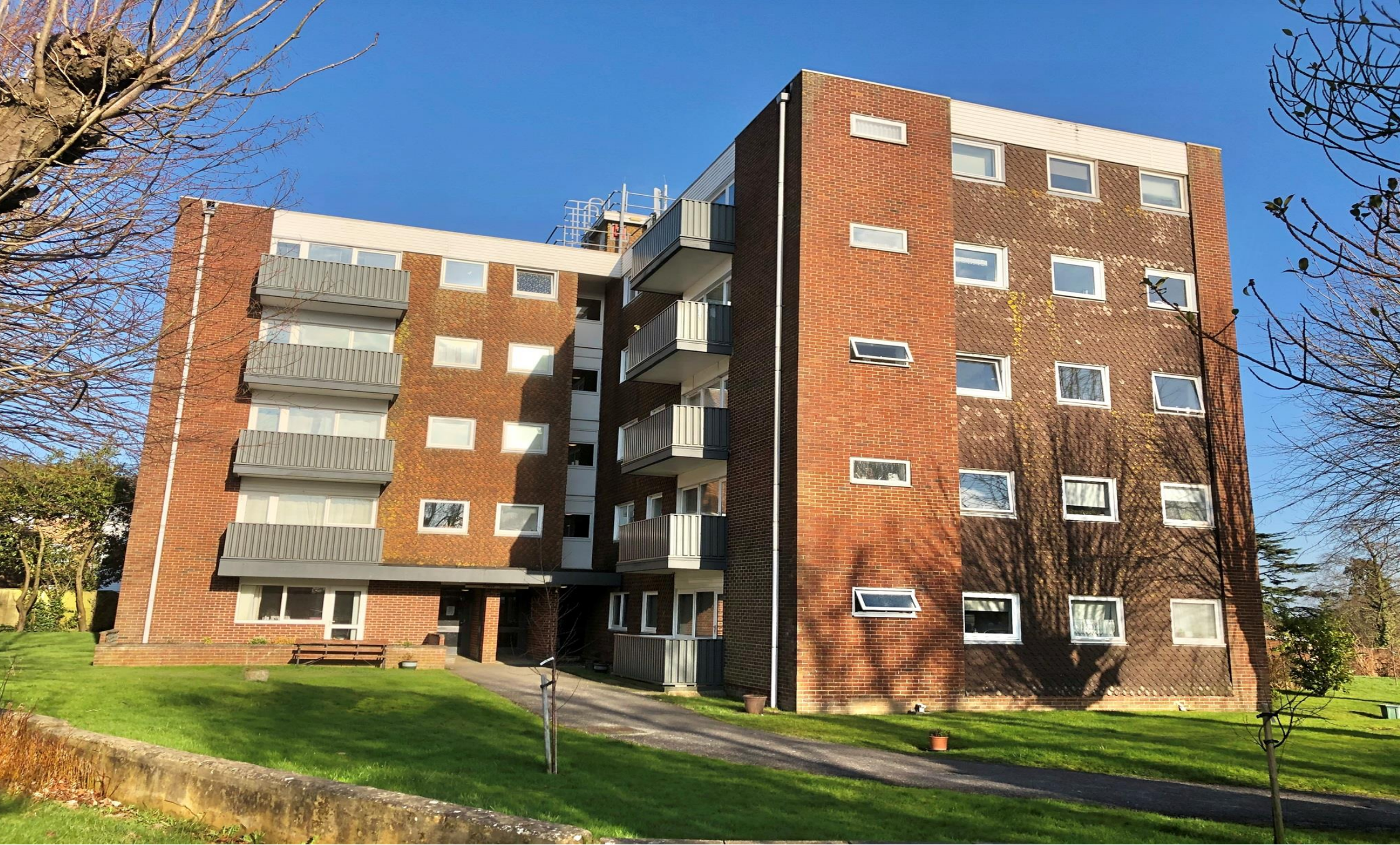
Tower House Silverdale Road, Burgess Hill, RH15 0EQ