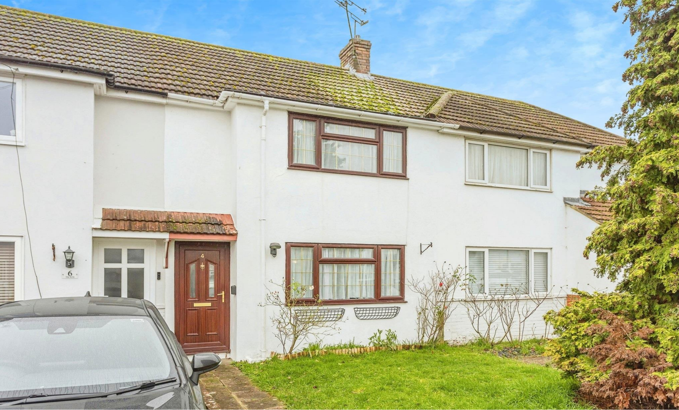
The Kiln, Burgess Hill RH15 0LU