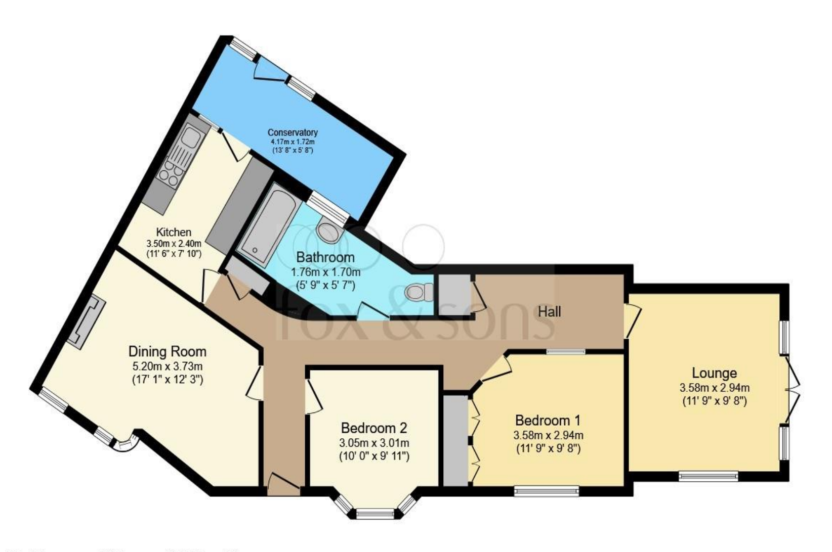
Total floor area 94.6 sq.m. (1,019 sq.ft.) approx

This floorplan is for illustrative purposes only and is not drawn to scale. Measurements, floor-areas, openings and orientations are approximate. They should not be relied upon for any purpose and do not form any part of an agreement. No liability is taken for any error or mis-statement. All parties must rely on their own inspections.