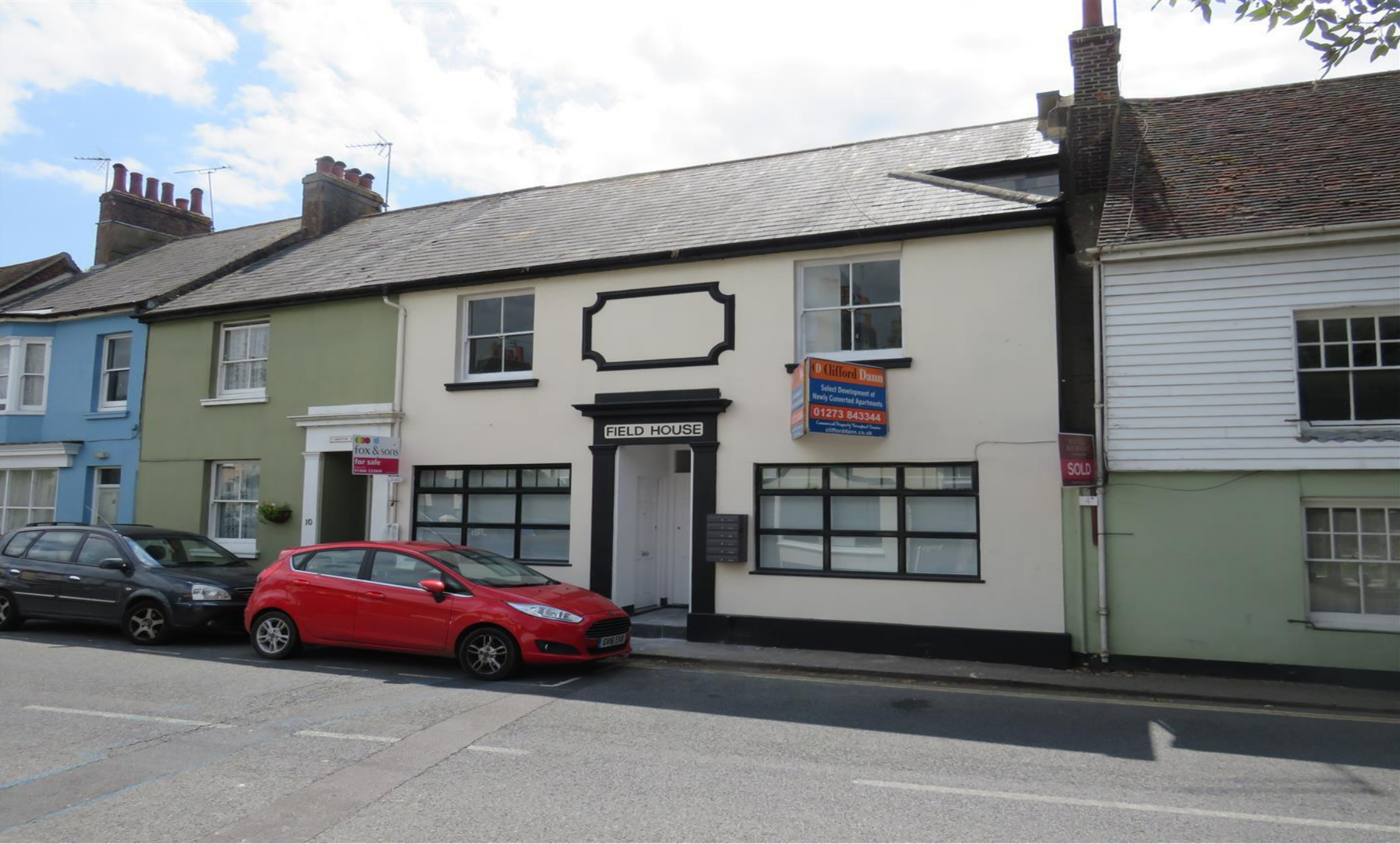
Field House High Street, Hurstpierpoint Hassocks BN6 9TY