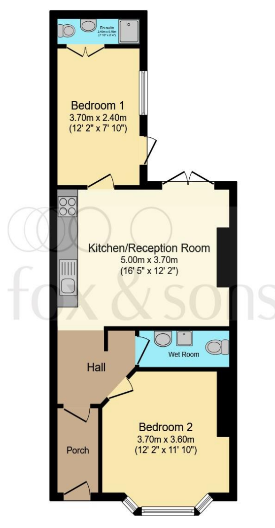
Total floor area 52.7 sq.m. (568 sq.ft.) approx

This floorplan is for illustrative purposes only and is not drawn to scale. Measurements, floor-areas, openings and orientations are approximate. They should not be relied upon for any purpose and do not form any part of an agreement. No liability is taken for any error or mis-statement. All parties must rely on their own inspections.