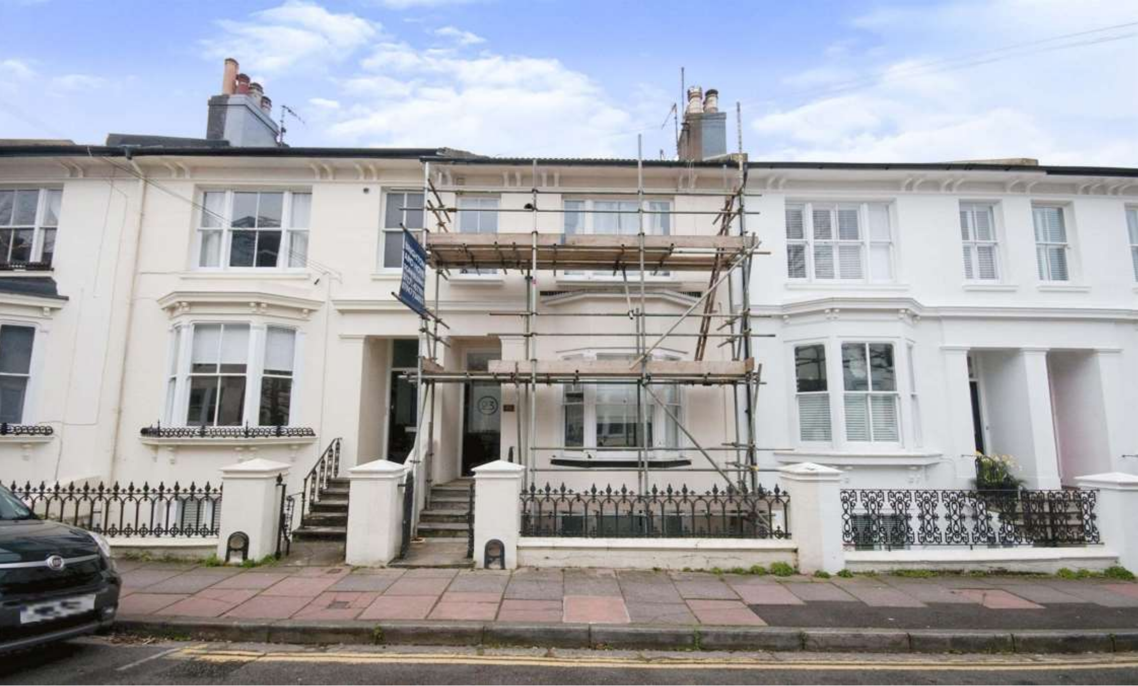
Prestonville Road, Brighton BN1 3TL