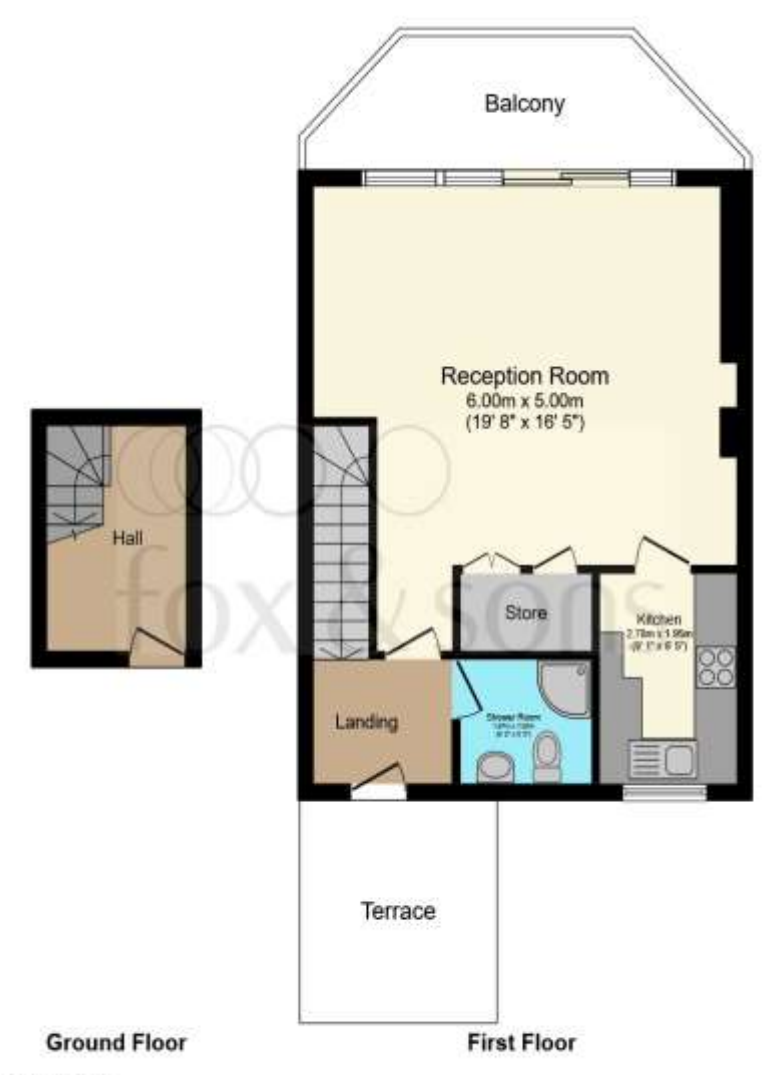
Total floor area 53.2 sq.m. (572 sq.ft.) approx

This floorplan is for illustrative purposes only and is not drawn to scale. Measurements, floor-areas, openings and orientations are approximate. They should not be relied upon for any purpose and do not form any part of an agreement. No liability is taken for any error or mis-statement. All parties must rely on their own inspections.