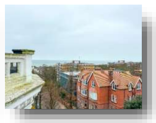
Brighton Girls Complete Gardens Victoria Rd Map data © 2024