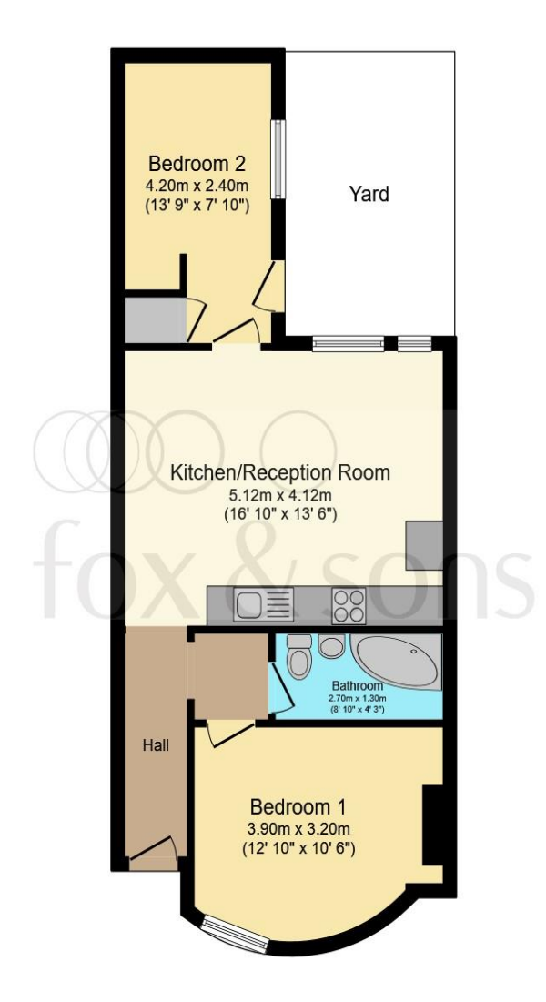
Total floor area 52.8 m² (568 sq.ft.) approx

This floorplan is for illustrative purposes only and is not drawn to scale. Measurements, floor-areas, openings and orientations are approximate. They should not be relied upon for any purpose and do not form any part of an agreement. No liability is taken for any error or mis-statement. All parties must rely on their own inspections.