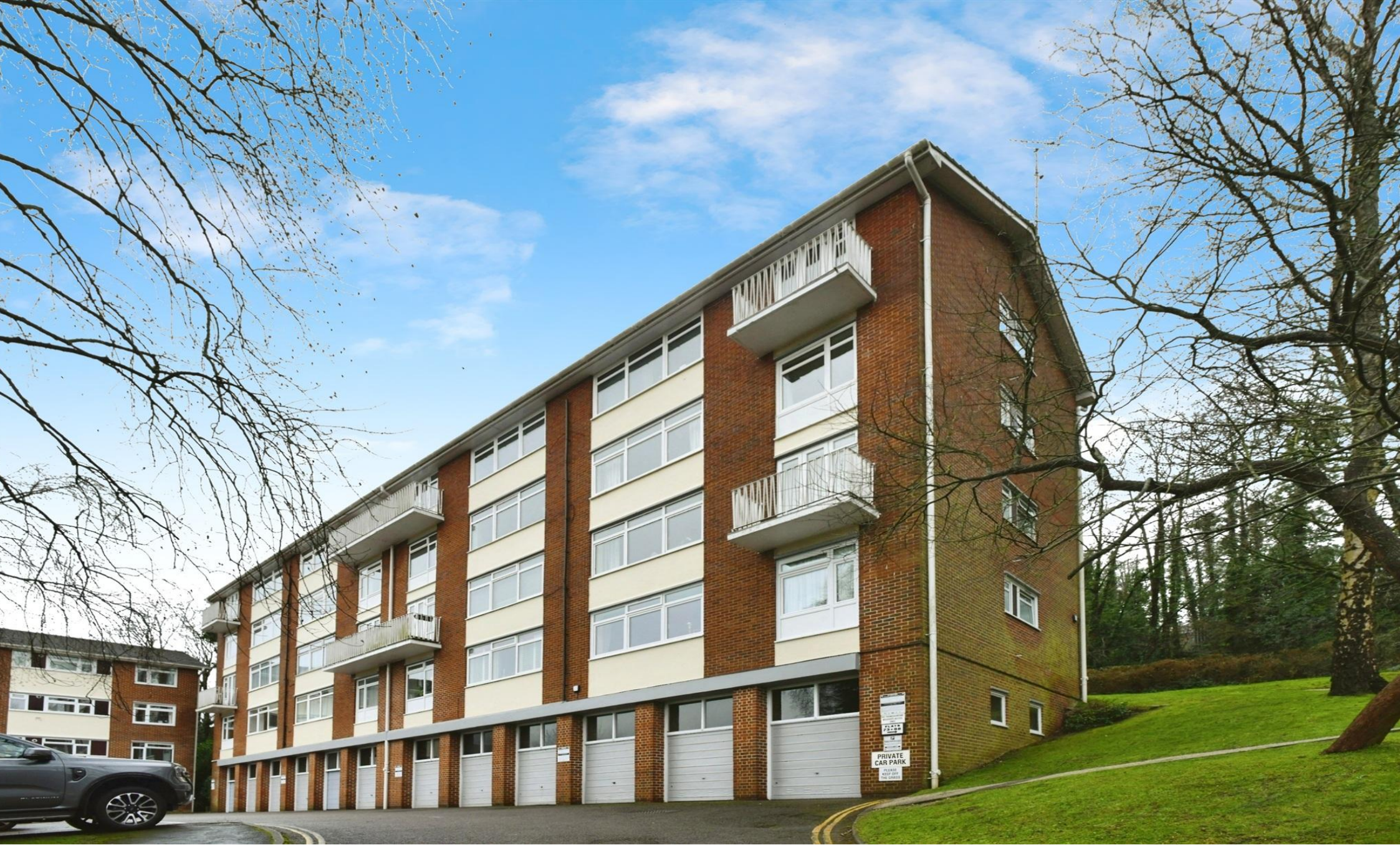
Leahurst Court, Brighton, BN1 6UN