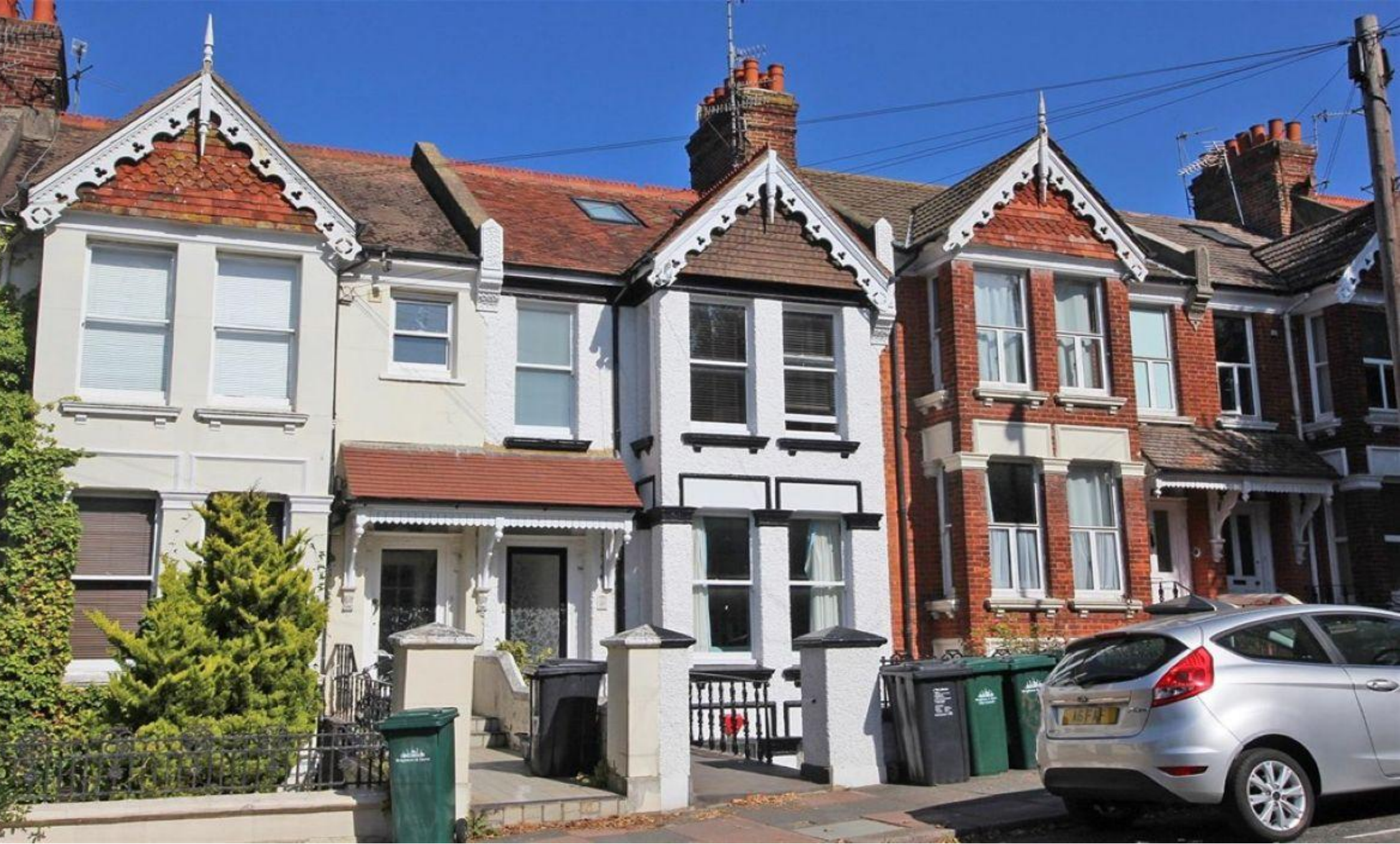
Preston Drove, Brighton, BN1 6LD