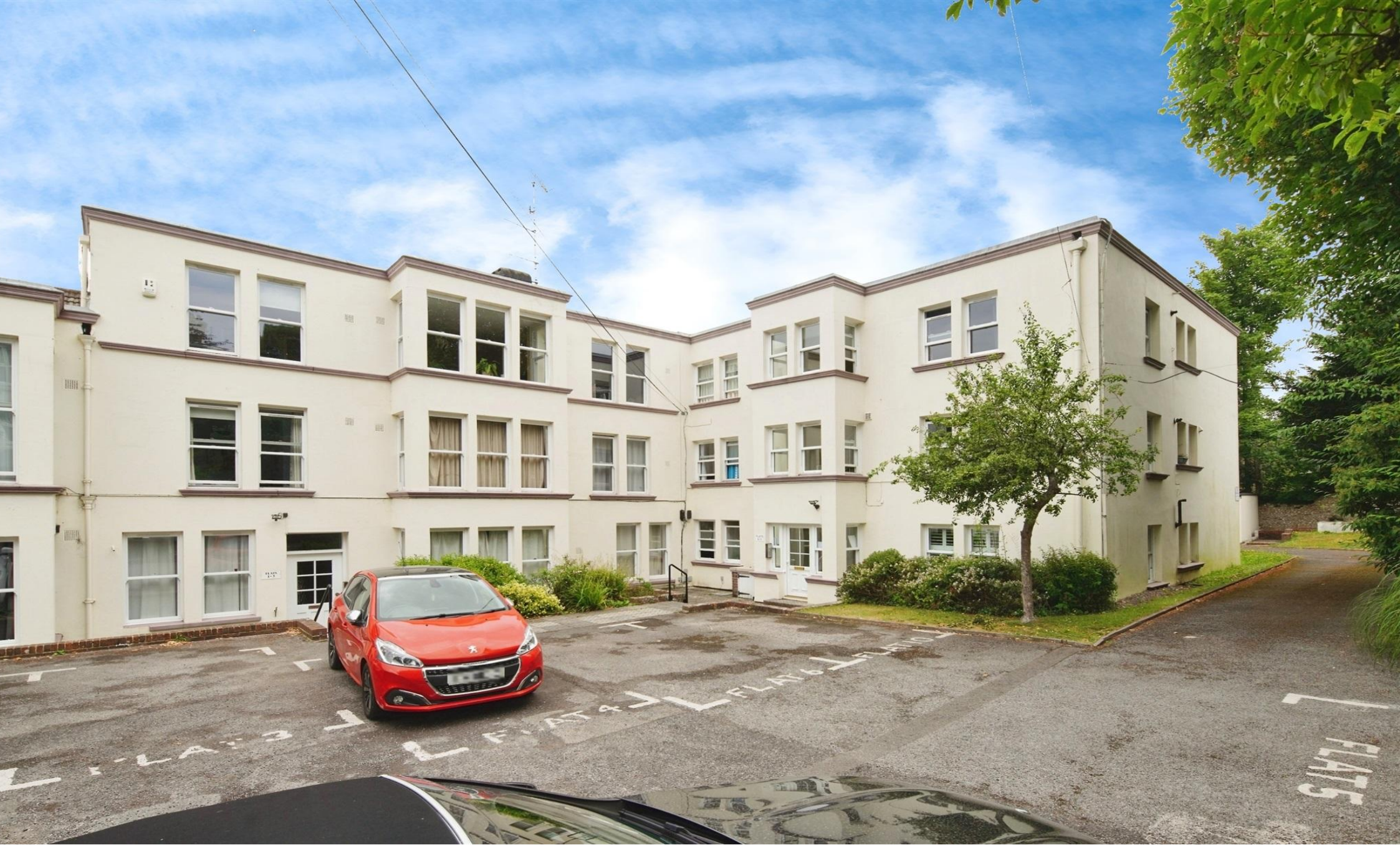
Harrington Mansions, Harrington Road, Brighton, BN1 6RE