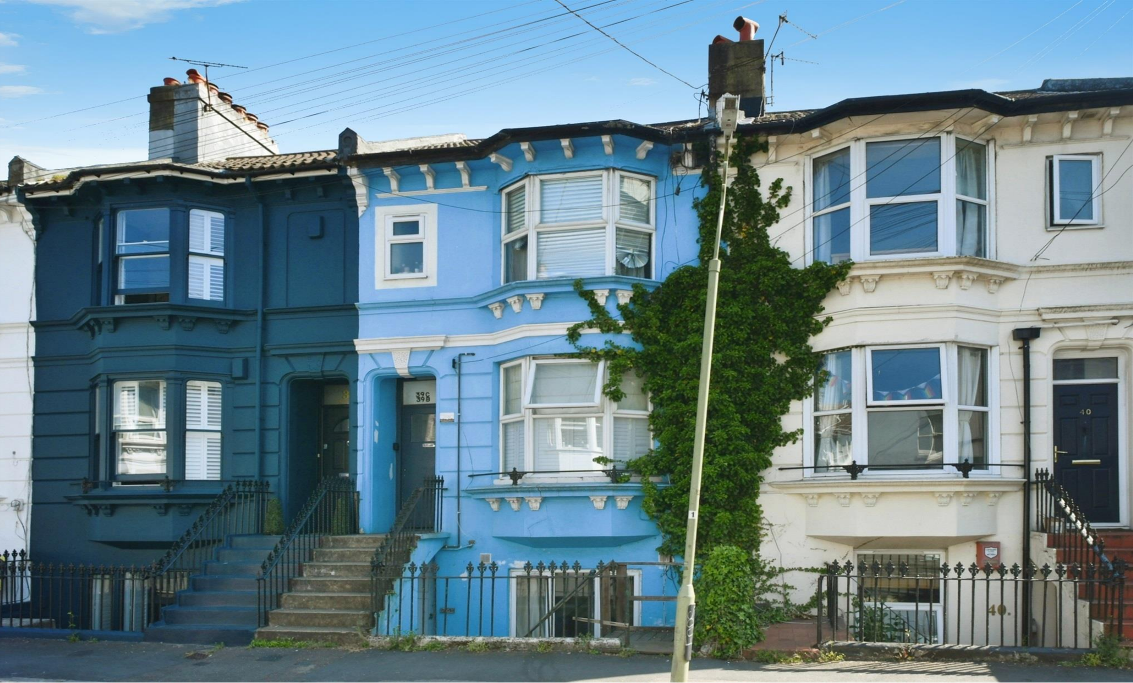
Campbell Road, Brighton, BN1 4QD