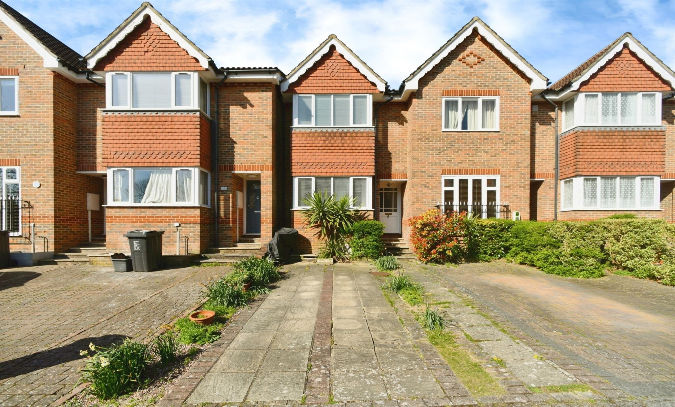
The Mews, Tower Gate, Brighton, BN1 6TU