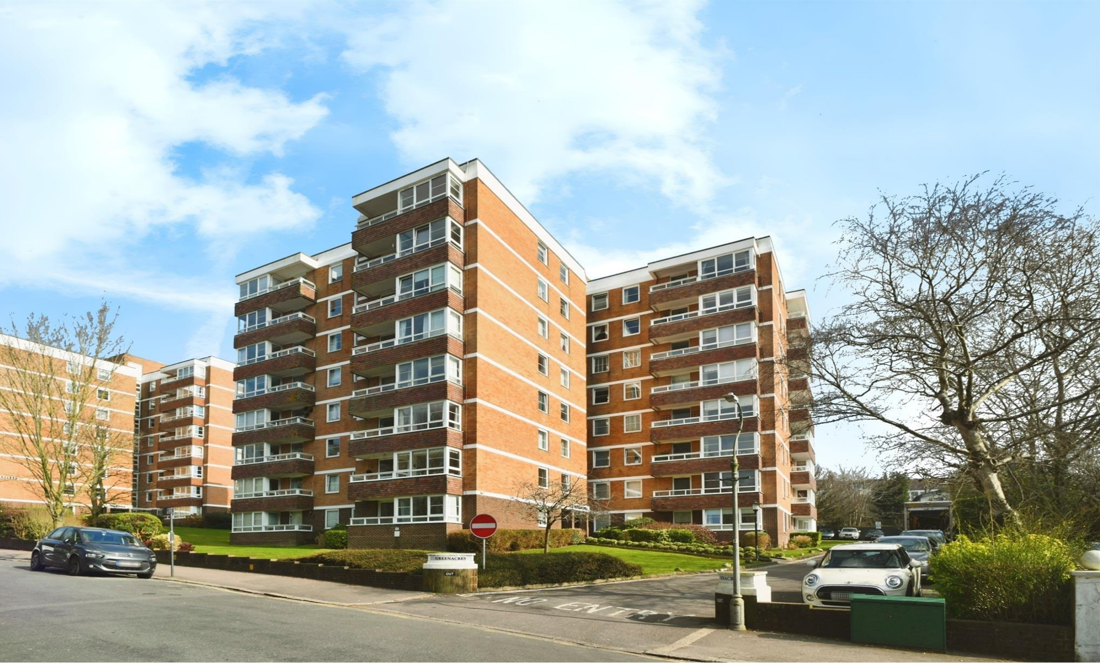
Greenacres, Preston Park Avenue, Brighton, BN1 6HR