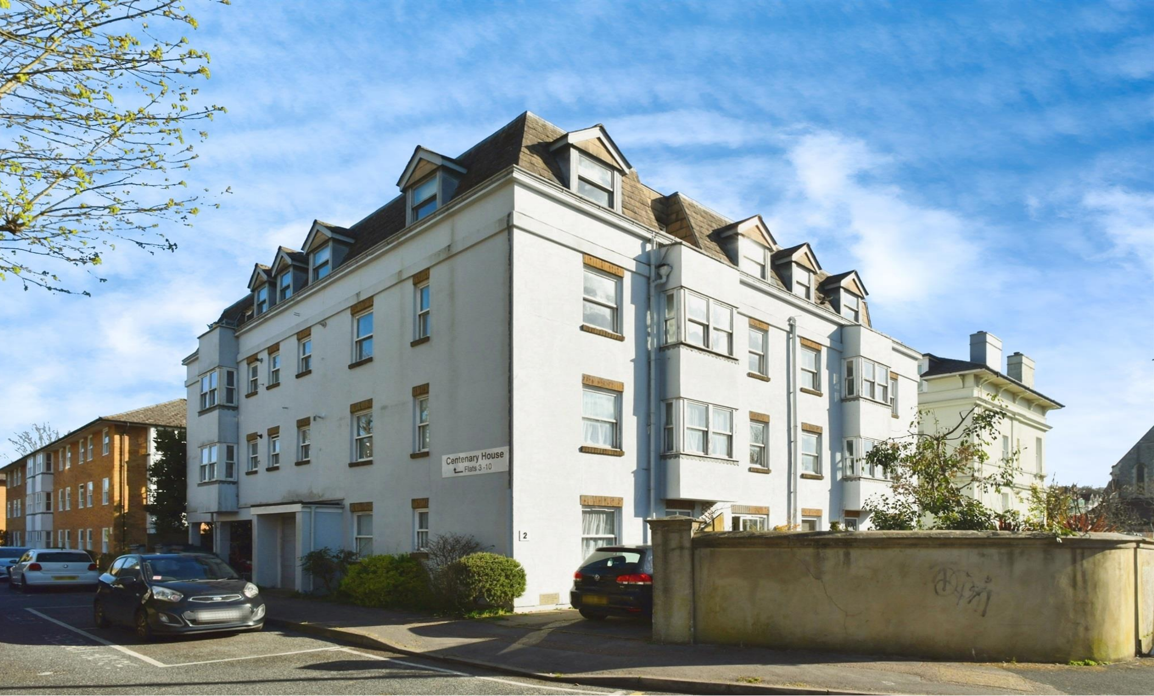
Centenary House, Cumberland Road, Brighton, BN1 6QR