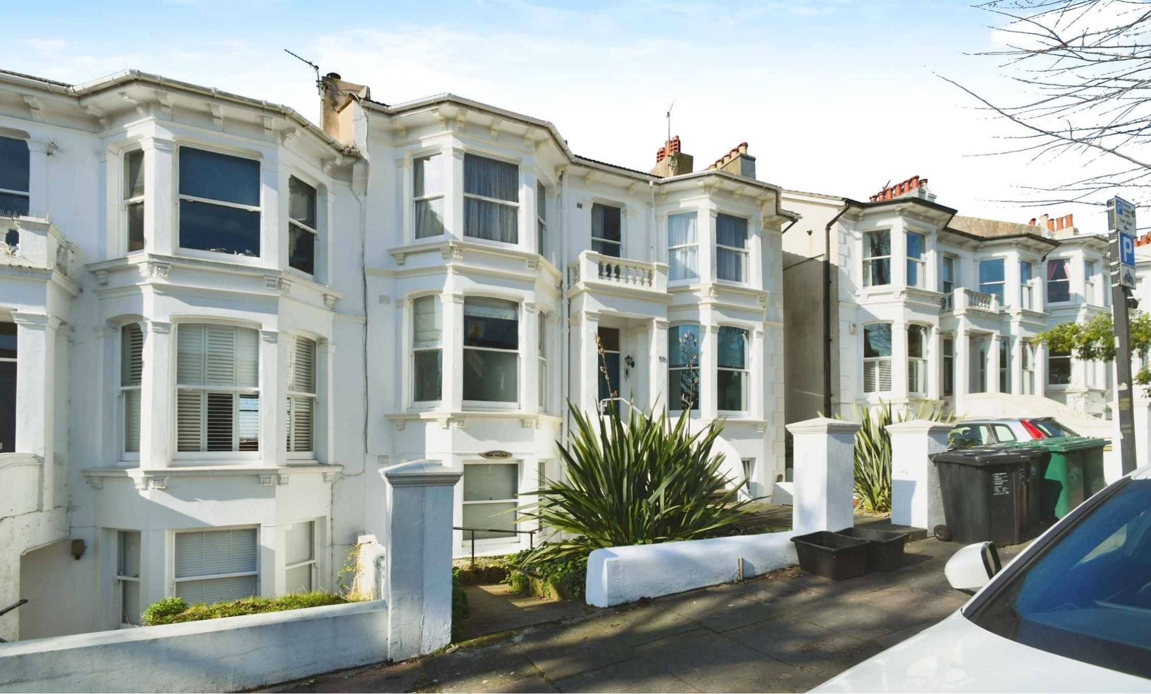
Beaconsfield Villas, Brighton, BN1 6HB