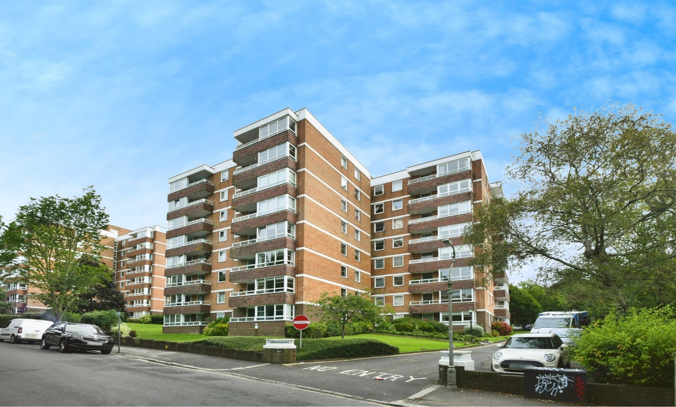
Greenacres, Preston Park Avenue, Brighton, BN1 6HR