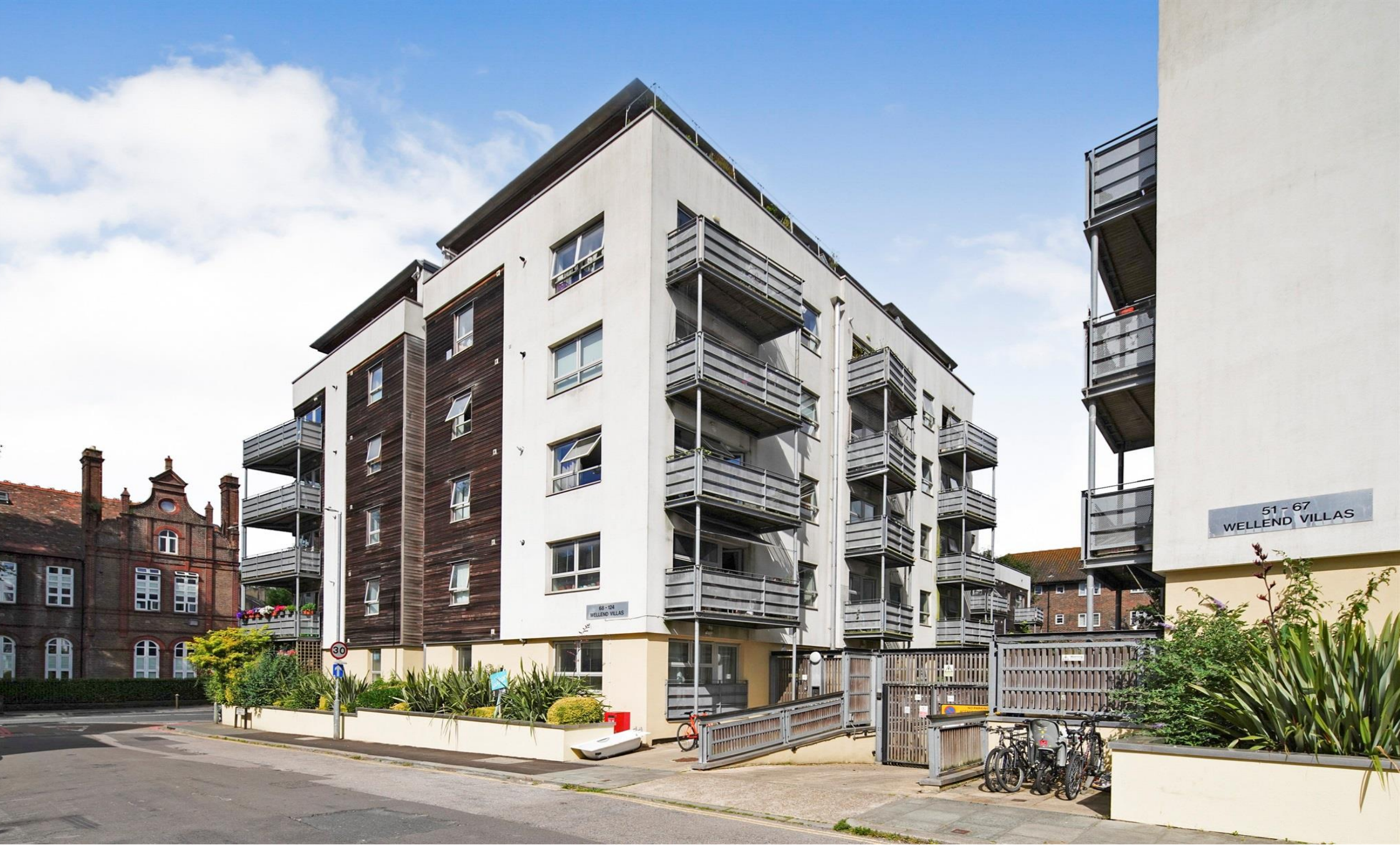
Wellend Villas, Springfield Road, Brighton, BN1 6BT