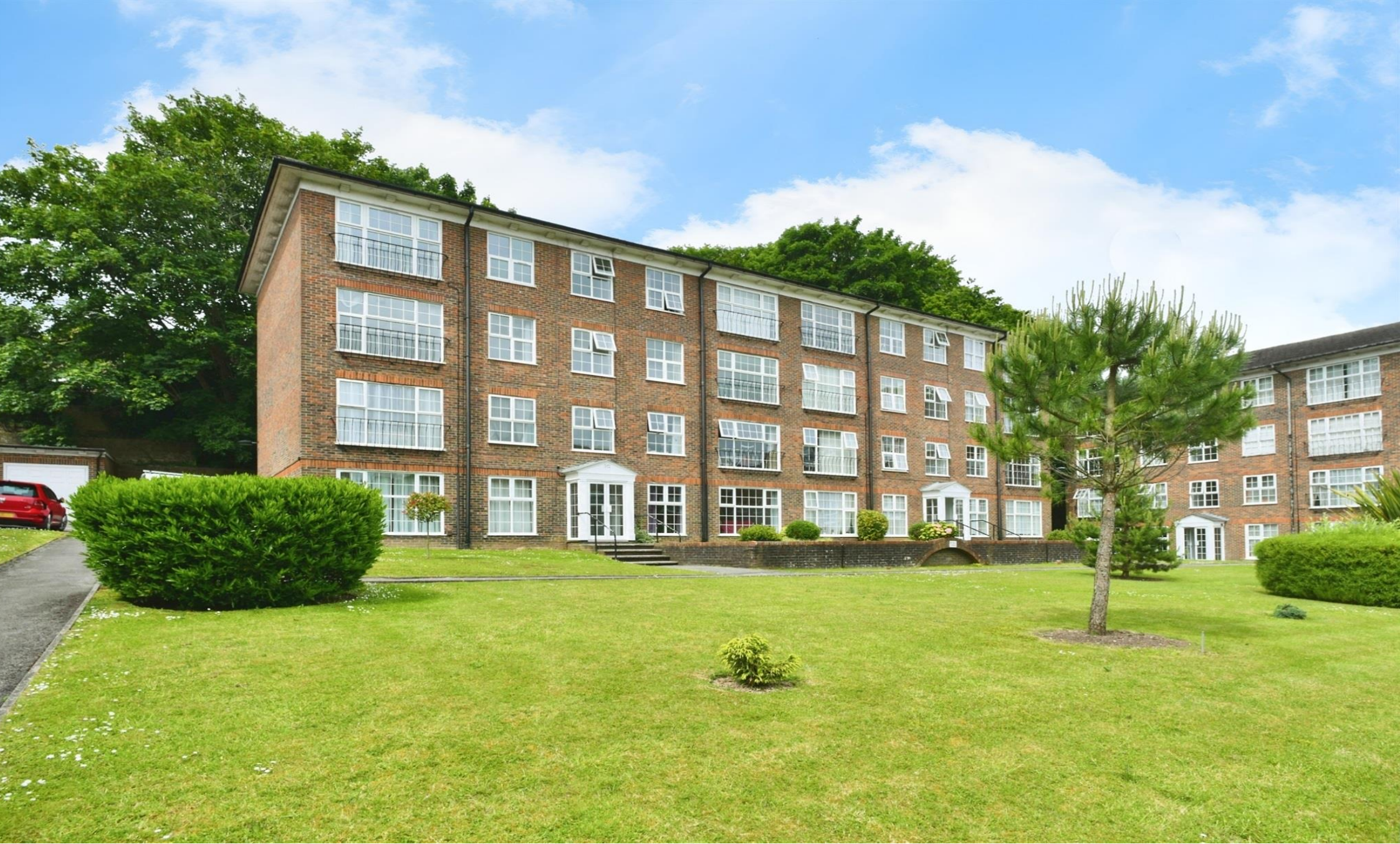
Regency Court, Withdean Rise, Brighton, BN1 6YG