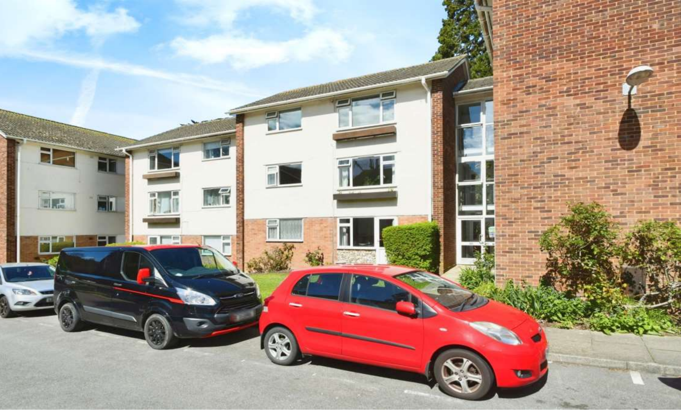
Cliveden Court, Cliveden Close, Brighton, BN1 6UE