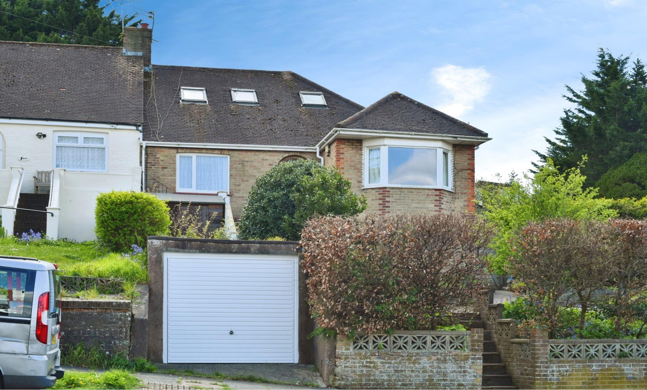
Greenfield Crescent, Brighton, BN1 8HJ