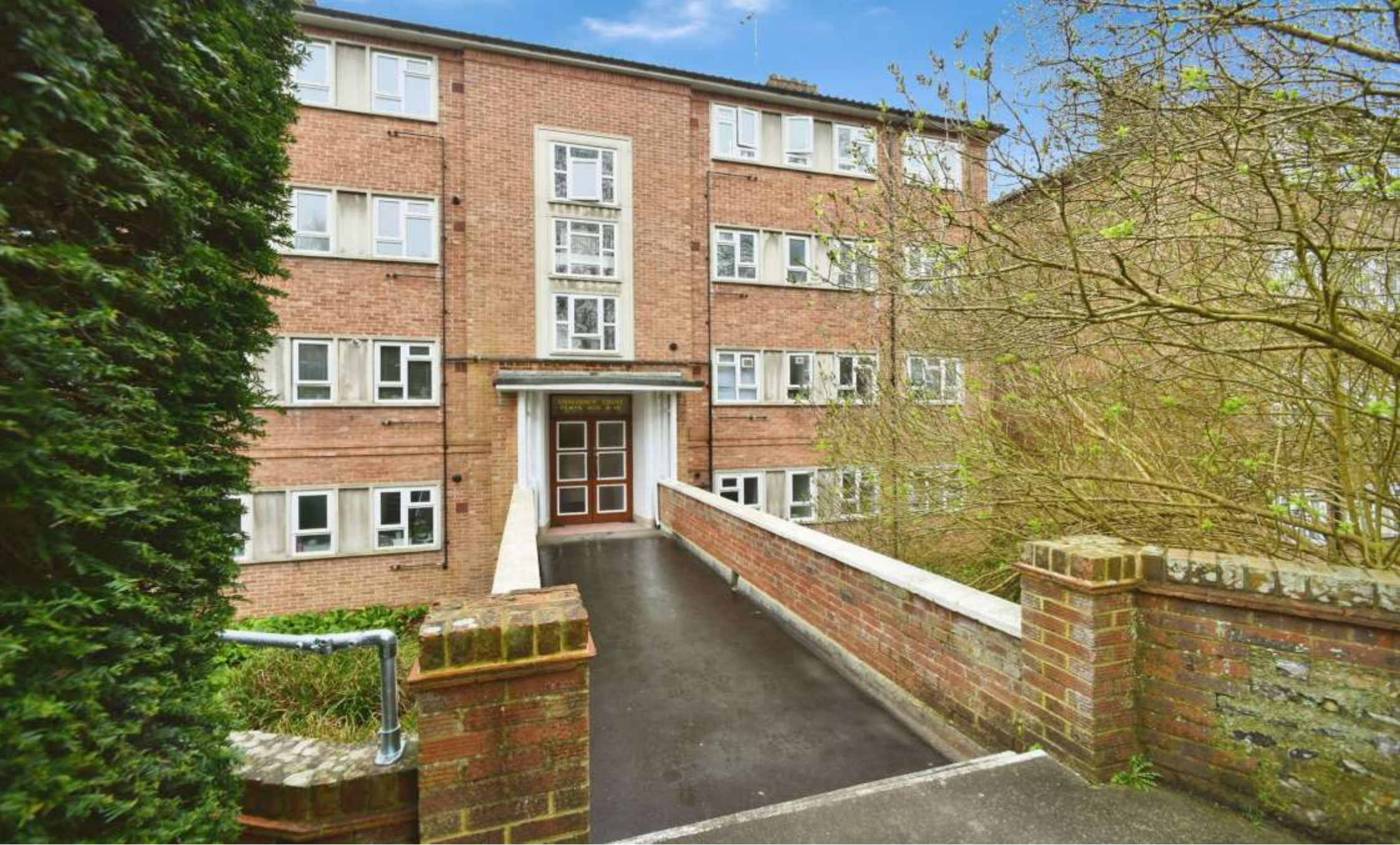
Grosvenor Court, Varndean Road, Brighton, BN1 6RR