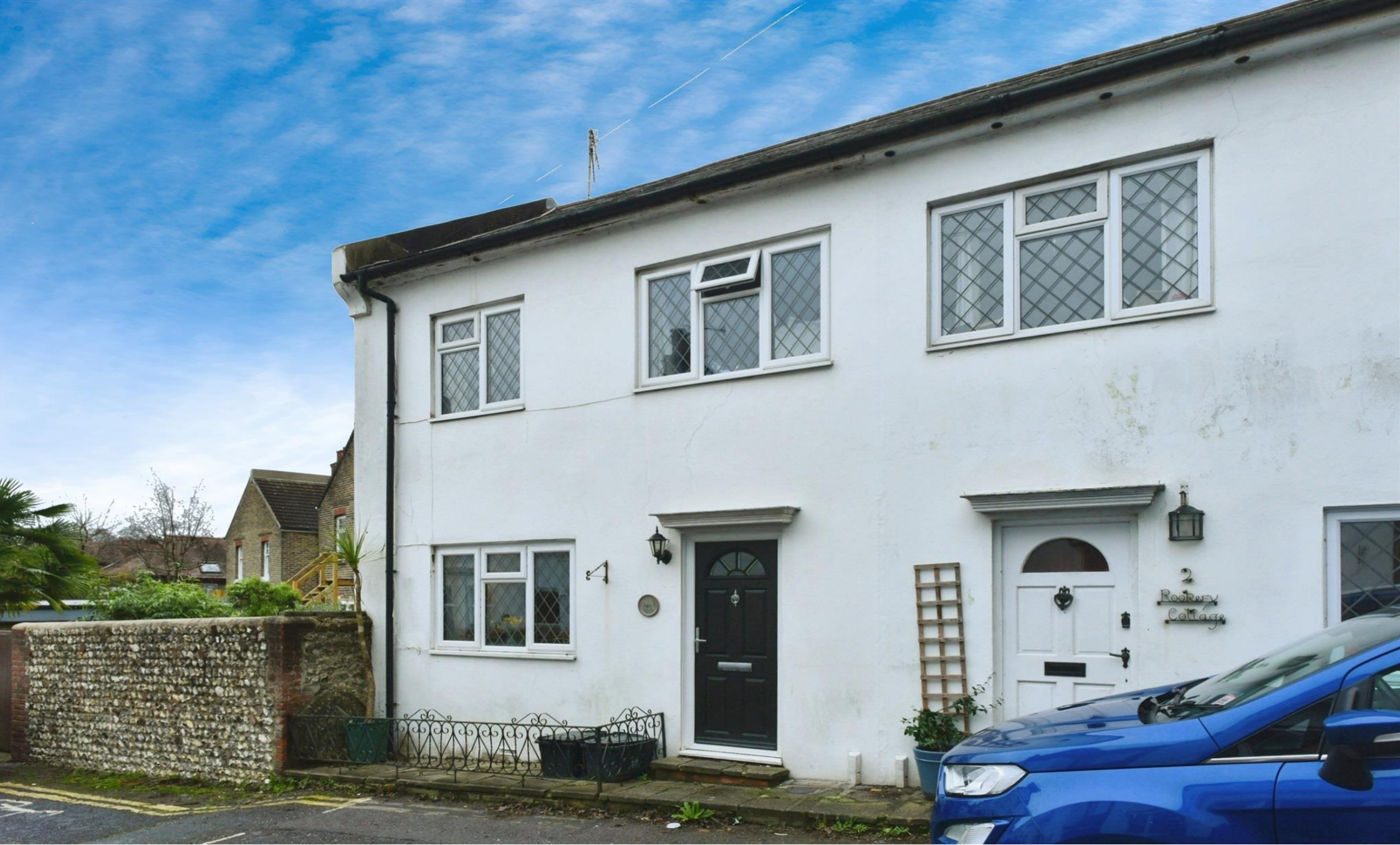
Rookery Cottages, Middle Road, Brighton, BN1 6SR