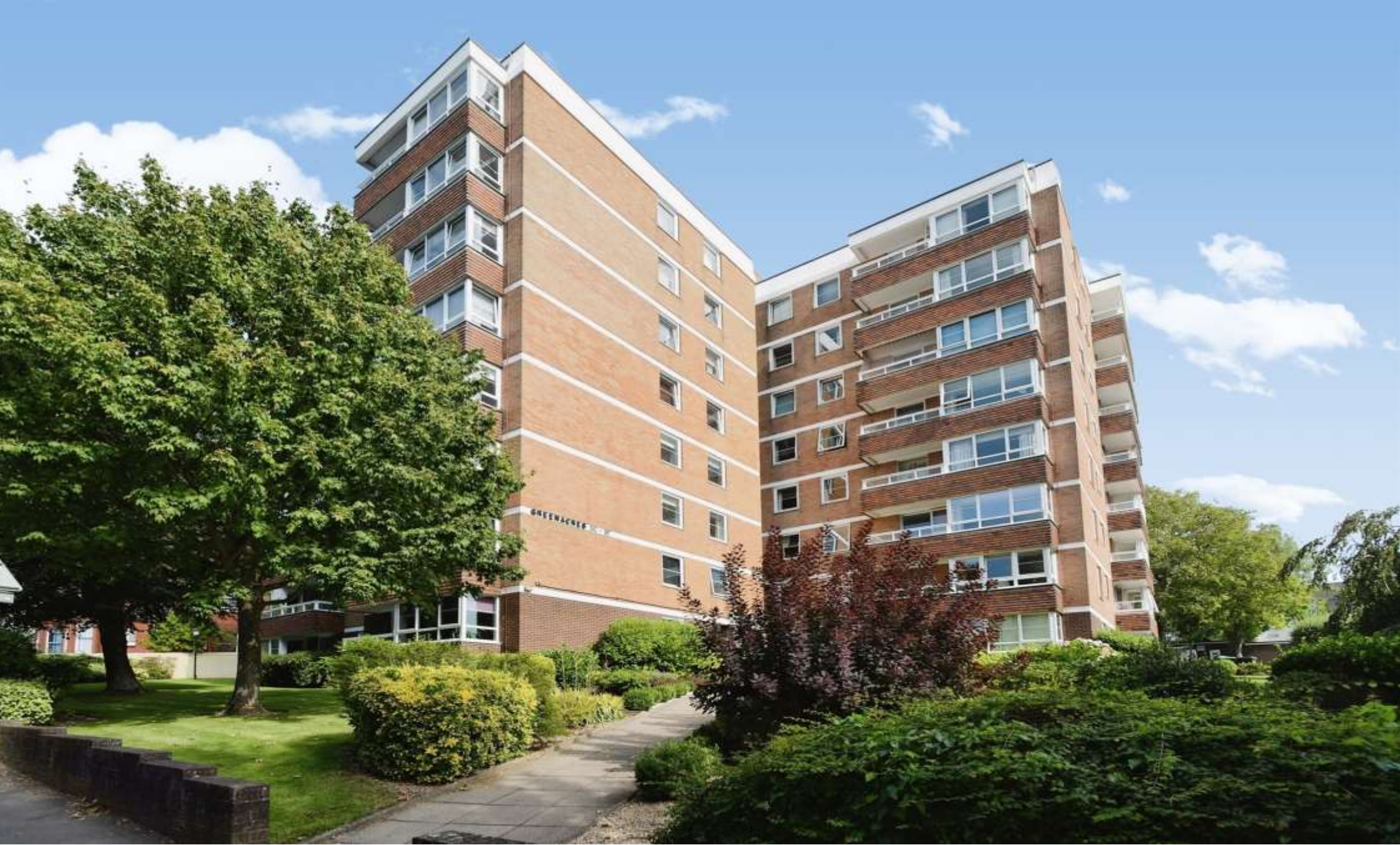
Greenacres, Preston Park Avenue, Brighton, BN1 6HR