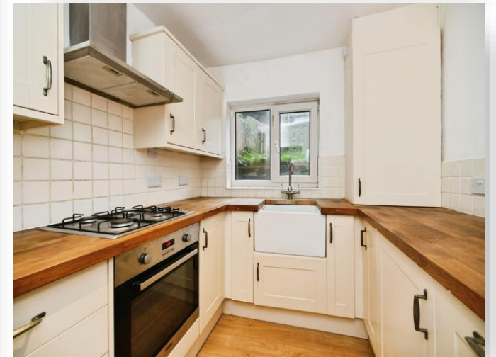
Ewhurst Road, Brighton BN2 4AL