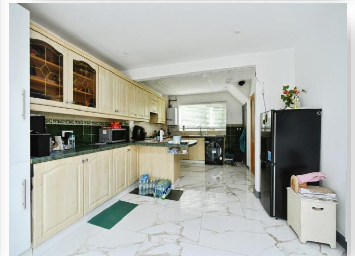
Mountfields, Brighton BN1 7BT