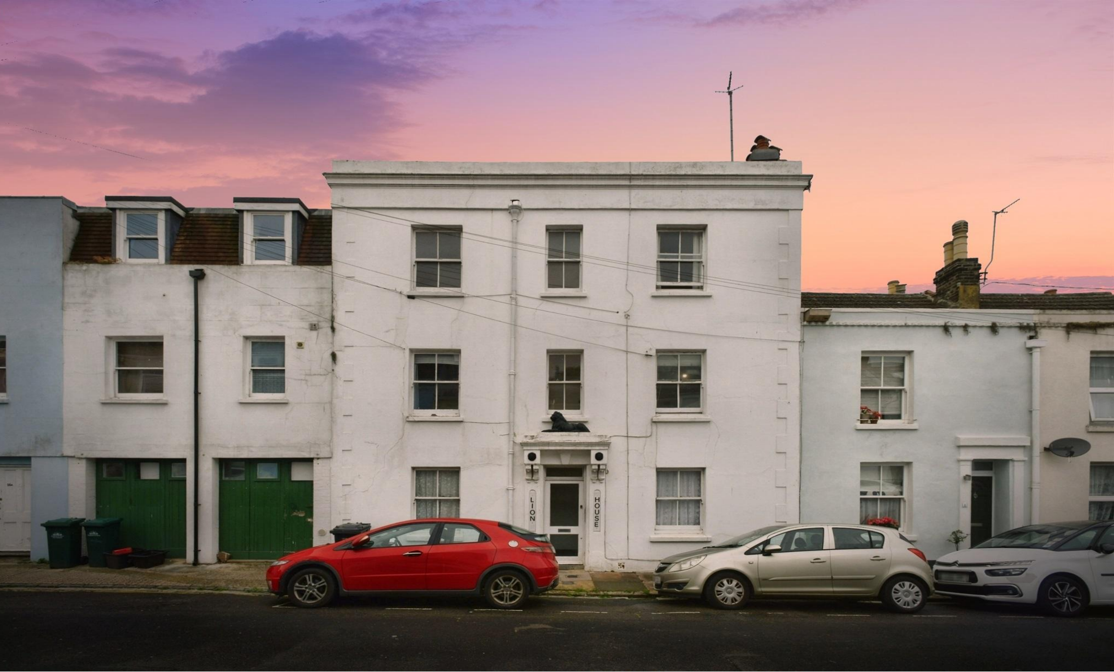
Lion House Milton Road, Brighton BN2 9TR