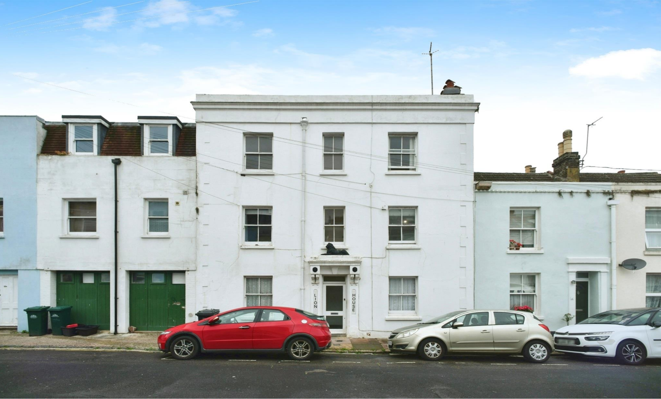
Lion House Milton Road, Brighton BN2 9TR