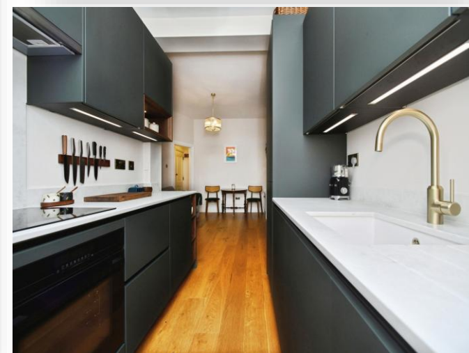
Roundhill Crescent, Brighton BN2 3FR