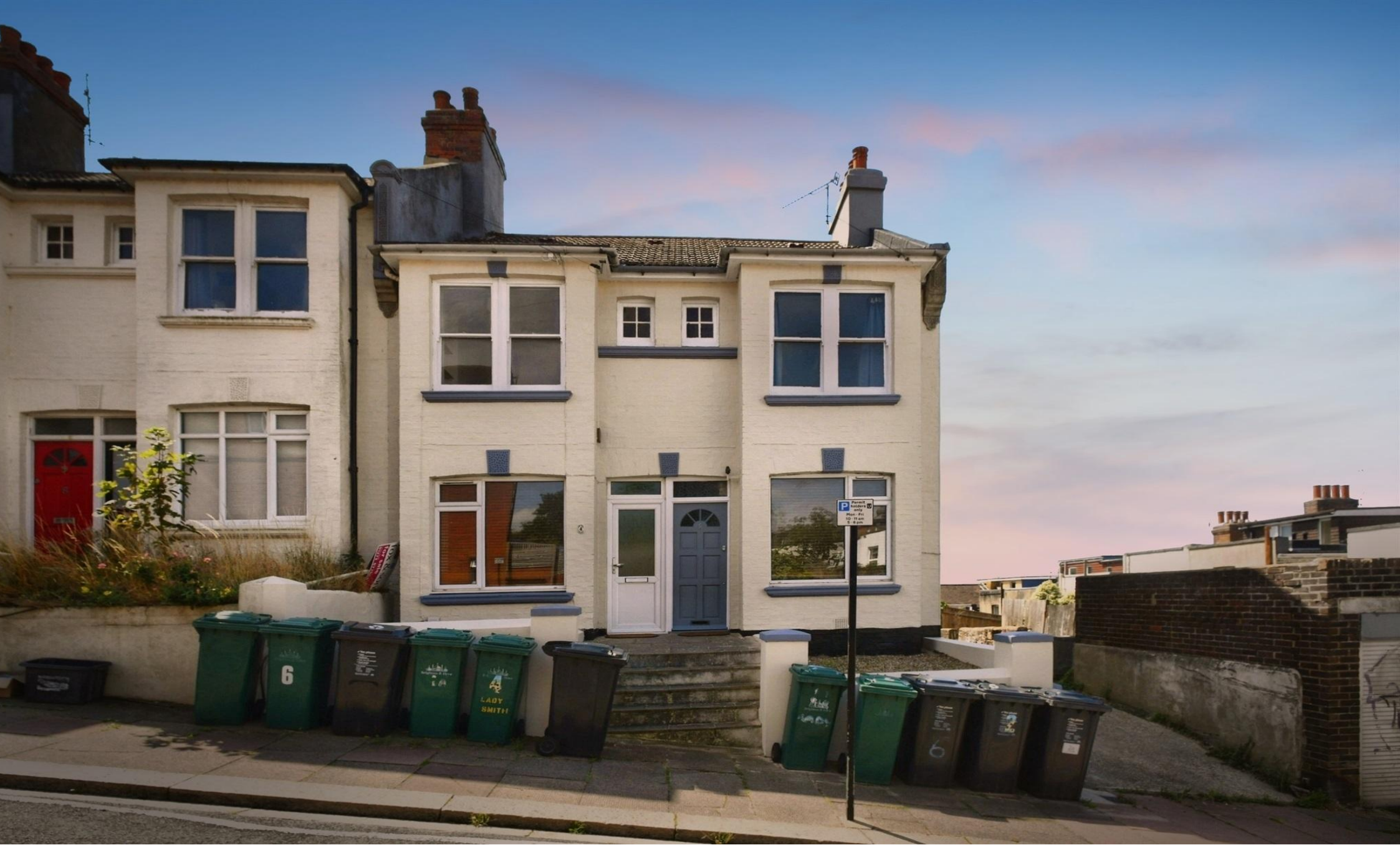
First Floor Flat Ladysmith Road, Brighton BN2 4EJ