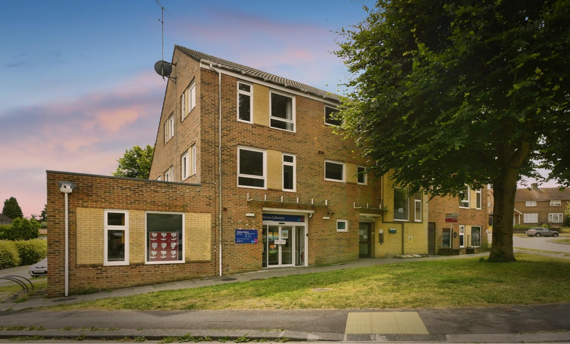
Library Court Beatty Avenue, Brighton BN1 9ED