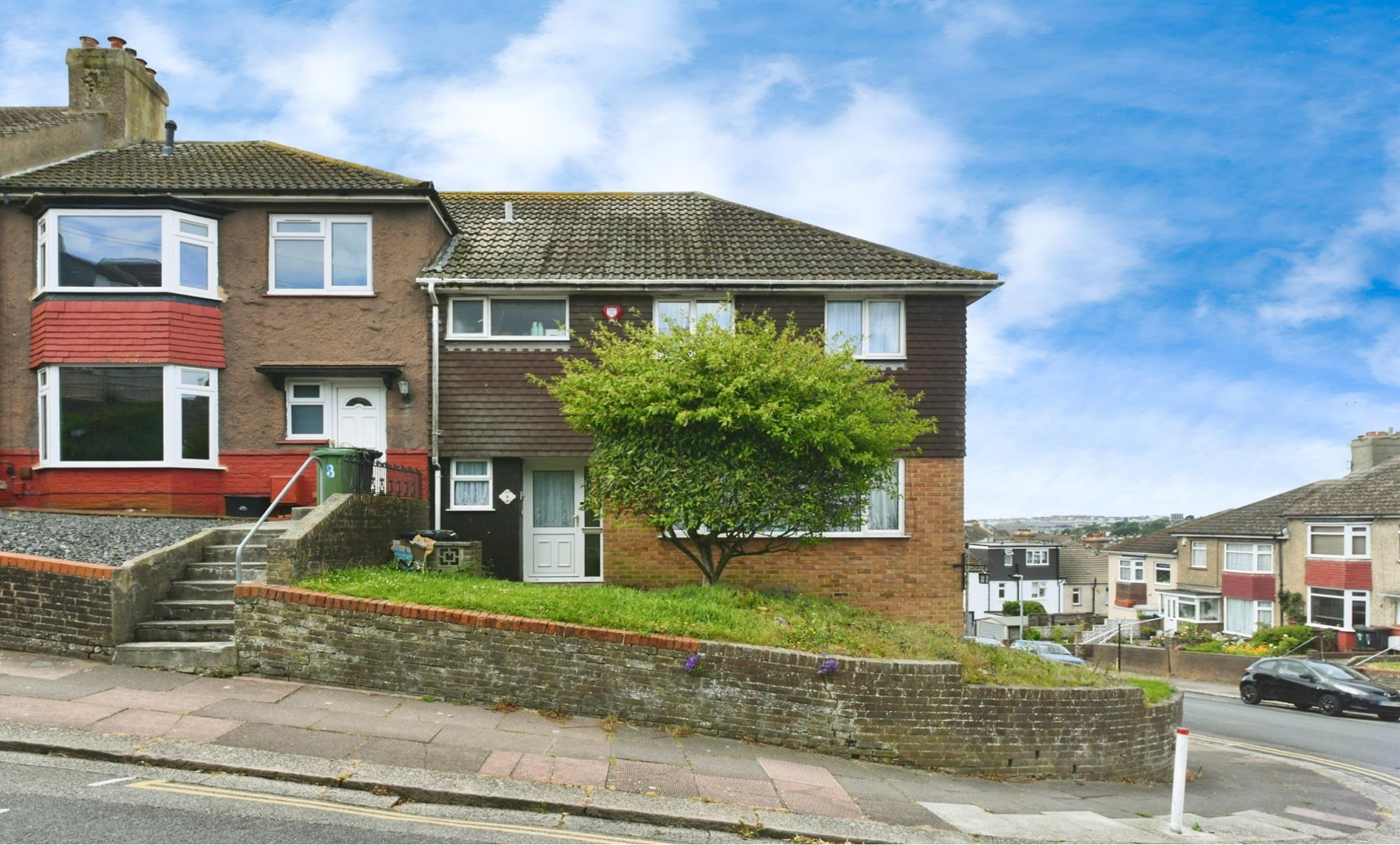
Carlyle Avenue, Brighton BN2 4DR