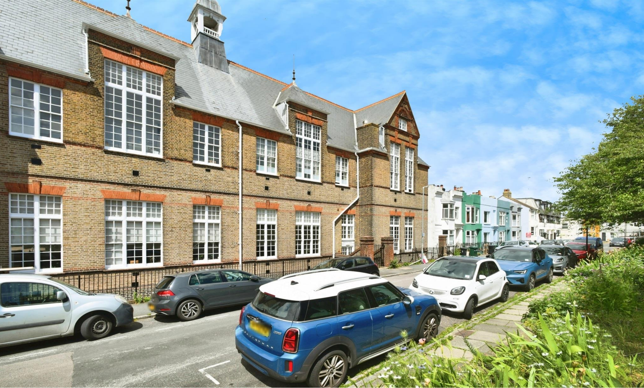
Hanover Lofts Finsbury Road, Brighton BN2 9YU