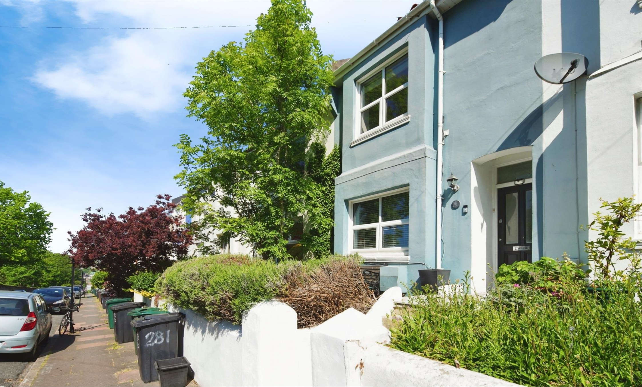
Bear Road, Brighton BN2 4DD