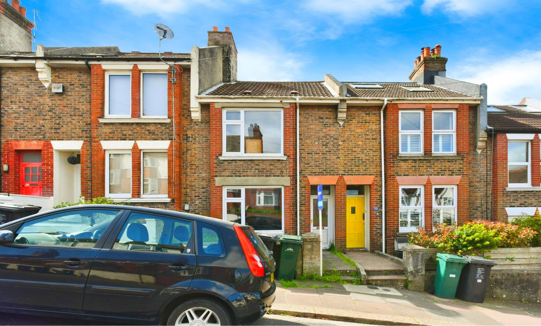
Ladysmith Road, Brighton BN2 4EJ