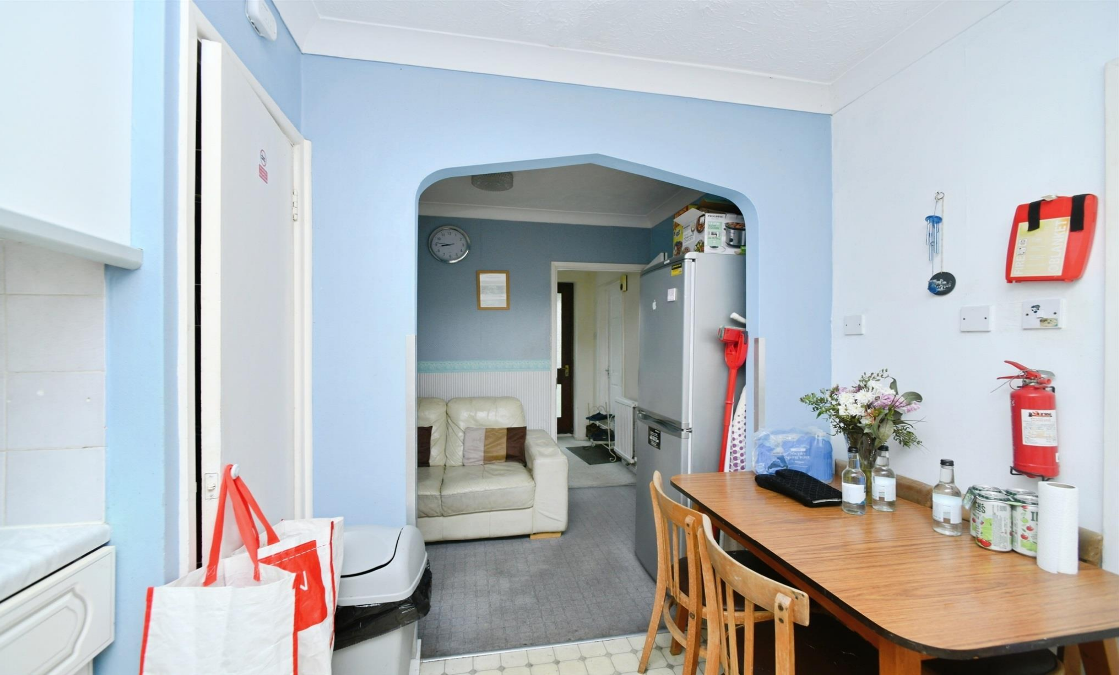
Staplefield Drive, Brighton BN2 4RL