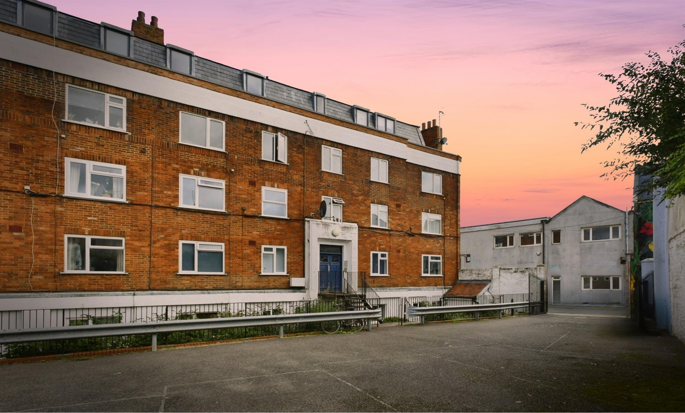
Devonian Court Park Crescent Place, Brighton BN2 3HG