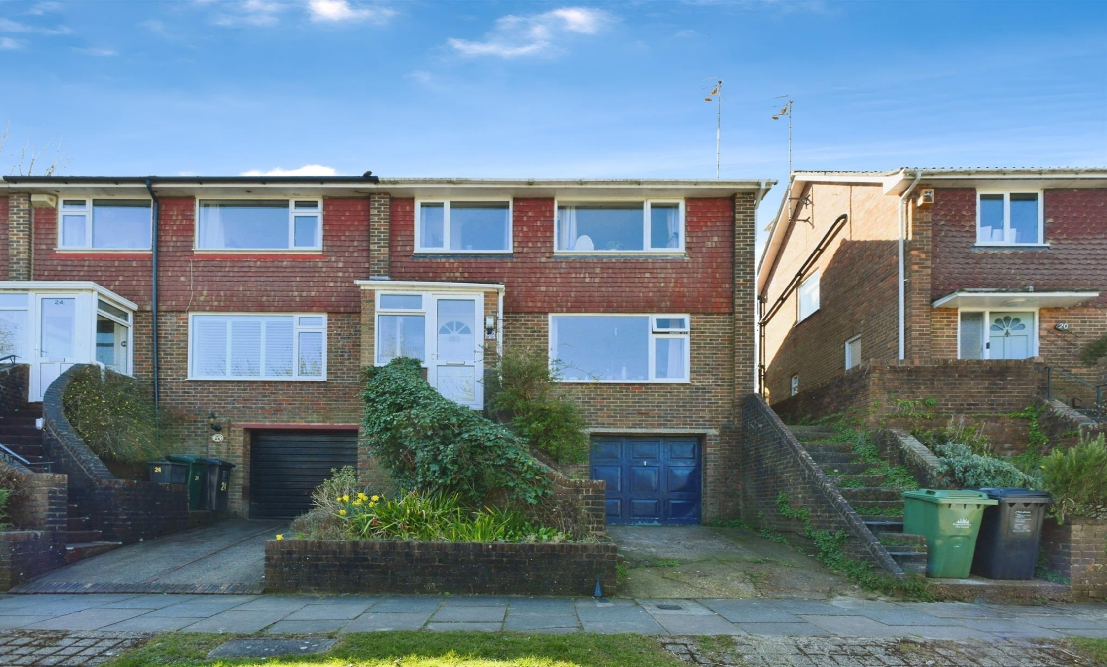
Willingdon Road, Brighton BN2 4DF