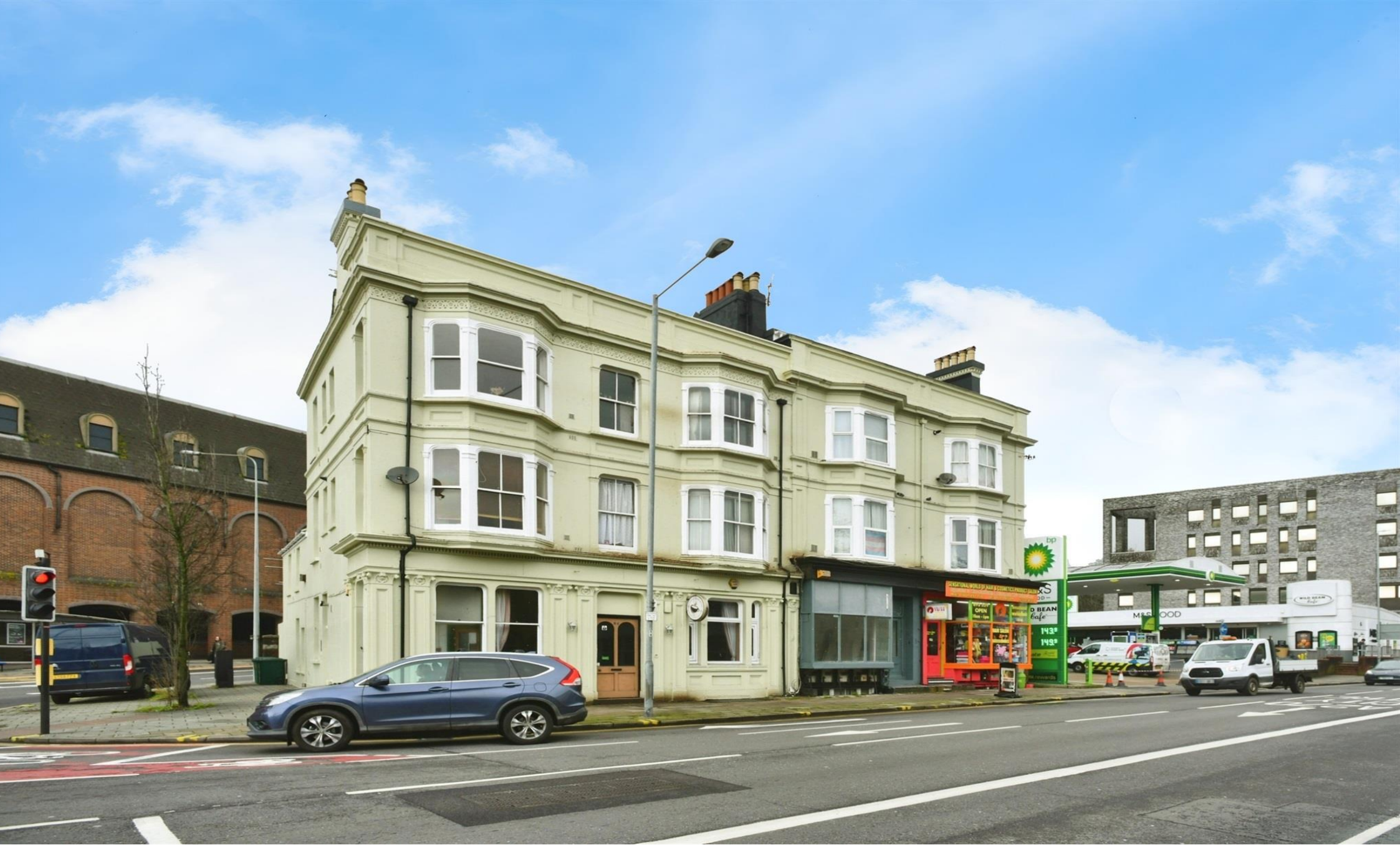
Lewes Road, Brighton BN2 3QA